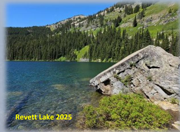
Revett Lake 2025