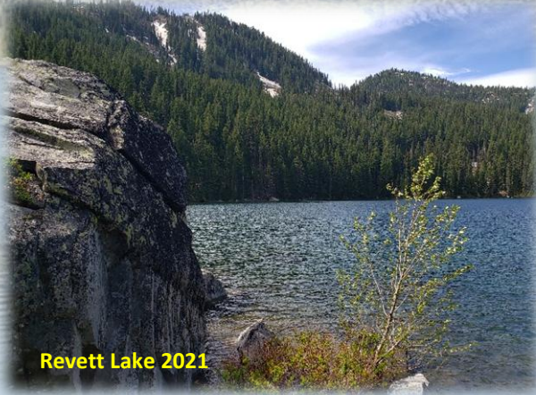
Revett Lake 2021

In 2023, my son (Colter) and I completed the Thompson Pass Loop and came into the lake at the outlet. The campsites at the inlet were full but there were still a couple sites near the outlet available.