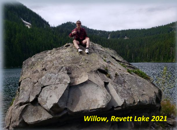
Willow, Revett Lake 2021

There is a nice little beach on the far side of the lake with a fire pit along the lake. Compared to the trail to the lake the lakeshore trail is quite rough, steep and has a few deadfalls across the trail. I have only fished this lake 1 time and did not do very well at all.