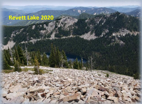
Revett Lake 2020