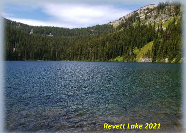
Revett Lake 2021

At the Lake: There are several campsites on both sides of the outlet and a couple others close to the inlet stream on the far end of the lake. You can probably squeeze in more than 10 parties into the various campsites if needed. There is a nice little beach on the far side of the lake with a fire pit along the lake.