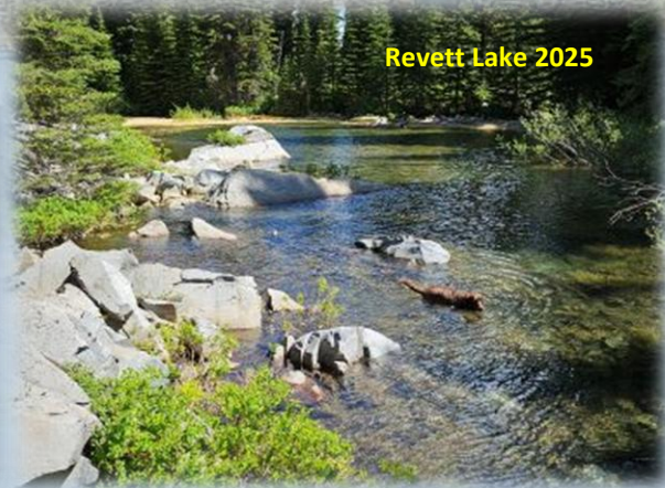
Revett Lake 2025