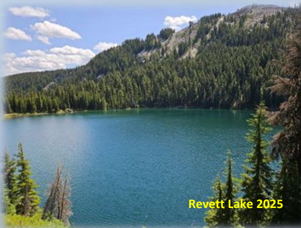
Revett Lake 2025