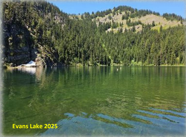
Evans Lake 2025