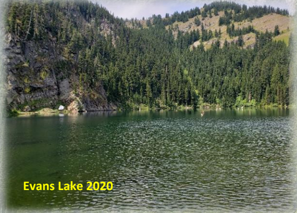
Evans Lake 2020