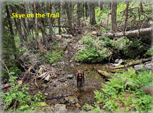
Skye on the Trail