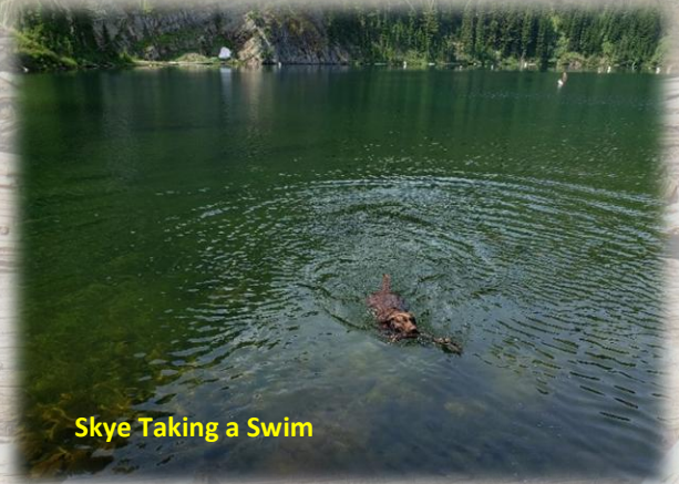
Skye Taking a Swim