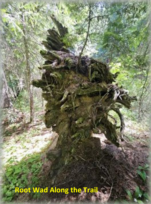
Root Wad Along the Trail