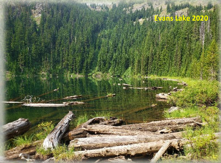
Evans Lake 2020