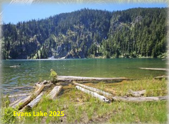
Evans Lake 2025