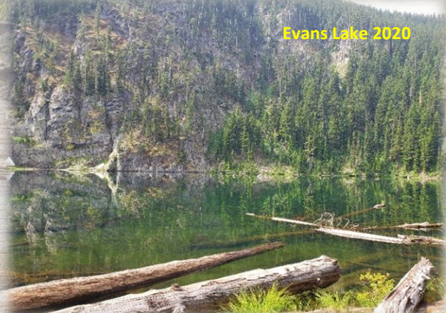
Evans Lake 2020

The trail does climb 2,000 feet over the 3.5 miles with a gain of 500 feet via 12 switchbacks over the last 1/2 mile to the lake. So, this is just not a stroll up to the lake as there are some steep but short pitches along the way. It is a short but steep drop down to the lake.