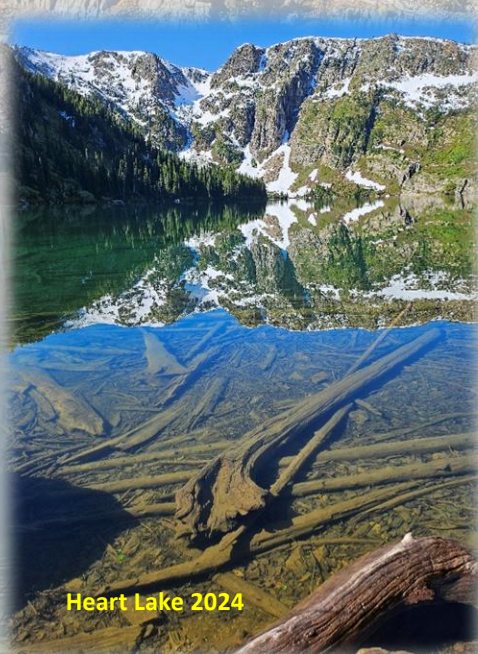
Heart Lake 2024

Because the lake is so big, the fishing remains adequate for brook trout. Don't be surprised to see goats hanging around the campsites during the day, they are not very wild. Part of the reason for this lake and trail guide is to help spread some of the pressure to other lesser known but equally spectacular areas.