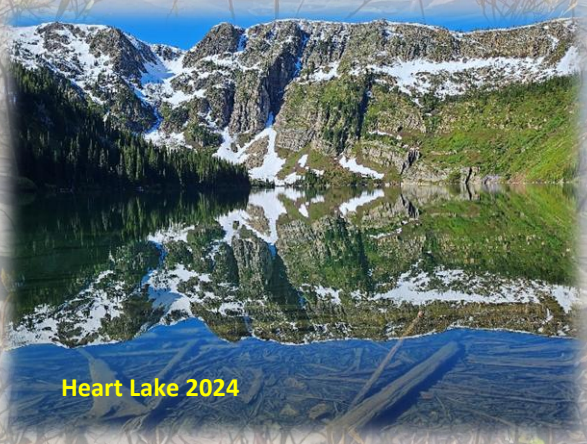
Heart Lake 2024