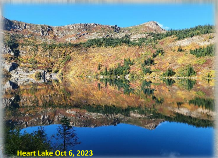
Heart Lake Oct 6, 2023

Lake. Once at Heart Lake, cross the outlet and continue around the left side of the lake on trail #175. Continue on Trail #175 past Pearl Lake to the saddle between Pearl and Dalton, then head right up the ridge to connect up with the state line trail #738. Follow the state line trail north for about 1.6 miles where you will connect with Trail #171 that will take you into the basin above Heart Lake and eventually back down to Heart Lake. I completed this loop in 2023 and the trail was in good shape. Take Trail #171 back to the trailhead for a total of 10.5 miles for the day. Add to your day by dropping into Dalton Lake before heading up to the state line trail.