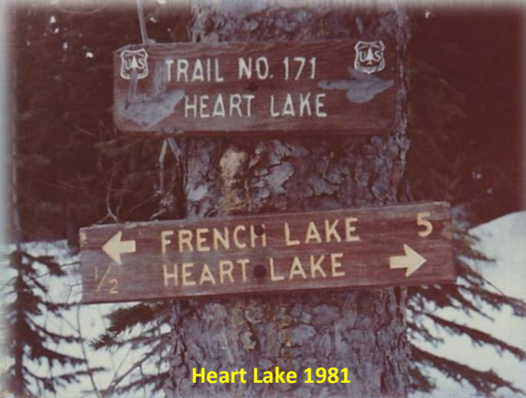
Heart Lake 1981