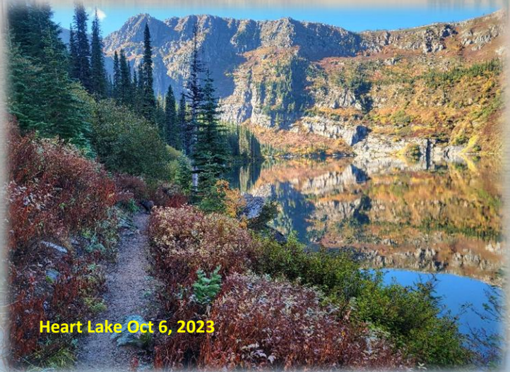
Heart Lake Oct 6, 2023