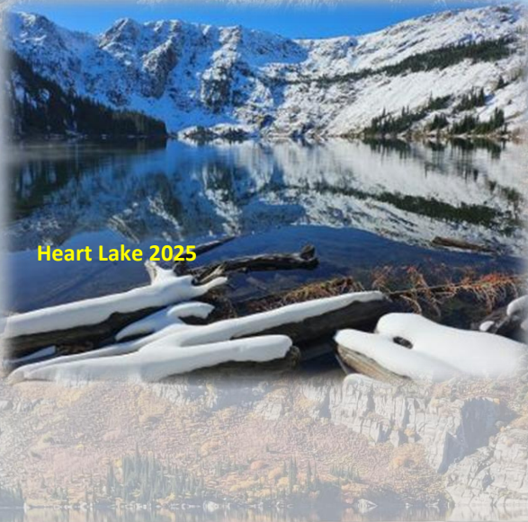
Heart Lake 2025