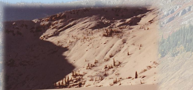
Heart Lake 1981

more) parties camped around the lake. One fellow had his tent set up on the main trail, it was a convenient flat spot. Overall, we saw at least 50 people that day on the trail and near the outlet and there must have been 30 vehicles parked at or near the trailhead. The scenery is still spectacular and yes, it is a wonderful location, but it was like going to Priest Lake.