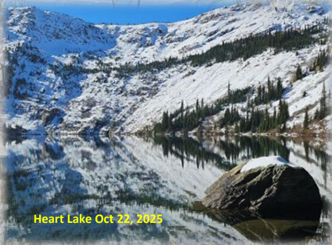
Heart Lake Oct 22, 2025