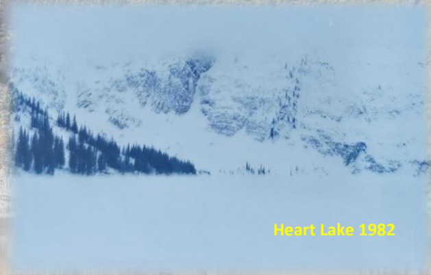
Heart Lake 1982