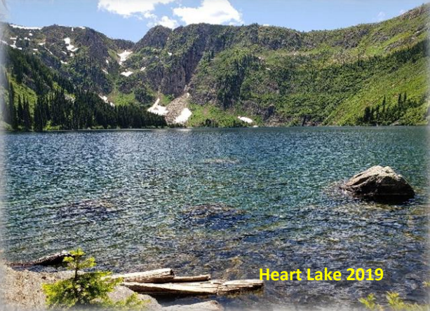
Heart Lake 2019

This lake is a classic example of being overused and degraded by too many people. Kathy and I went for a day hike to the lake several years ago and there were at least a dozen (if not