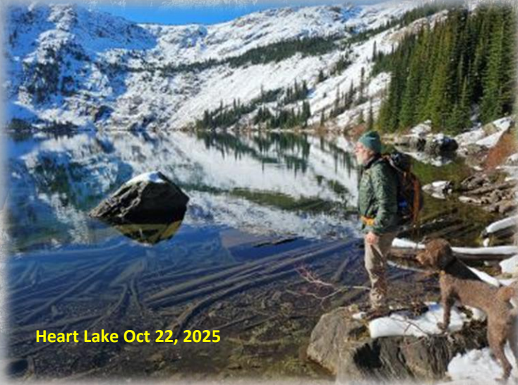
Heart Lake Oct 22, 2025