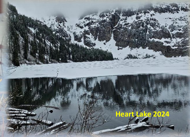
Heart Lake 2024