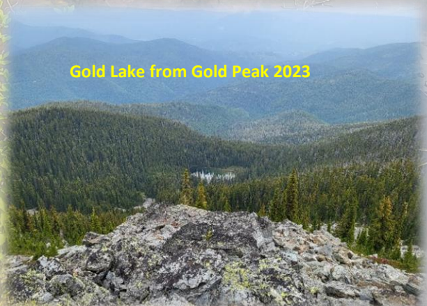
Gold Lake from Gold Peak 2023

There is a large rock (4'x6') next to the trail.