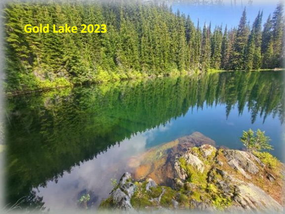
Gold Lake 2023

enough of a signal to view imagery. Follow the path of least resistance on the ridge and as you angle down towards the lake. It is steep and at times brushy, but mostly steep.