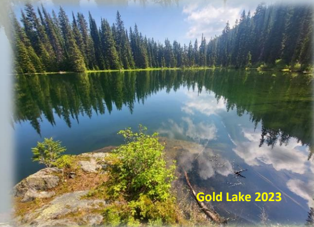
Gold Lake 2023

This is your jumping off point to stay on the ridge to your right and continue towards Gold Peak. Your goal is to head for the rock fields below Gold Peak and follow them to the lake, well mostly to the lake. Although tempting, don't dive off the ridge too soon as you could miss the lake as it has a small profile and is not visible until almost there.