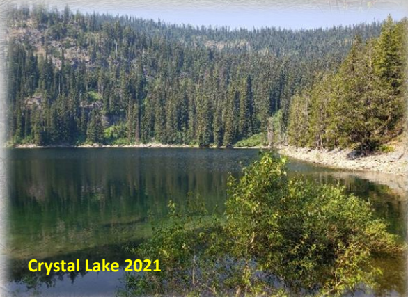
Crystal Lake 2021