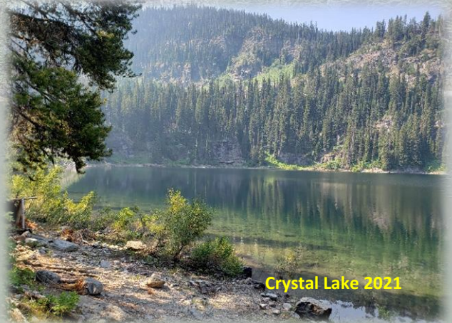
Crystal Lake 2021

At the Lake: There are several places to pitch a tent on either side of the outlet, but the right side is very minimal. There is also an outhouse to the left up in the trees. There are some small trout in the lake, but generally the fishing is poor. The shoreline is easy to get around and there is an old mine shaft on the far side of the lake. It is actually