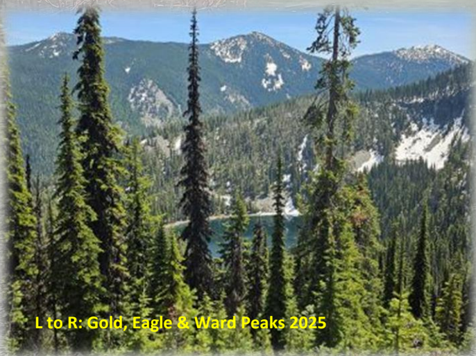
L to R: Gold, Eagle & Ward Peaks 2025