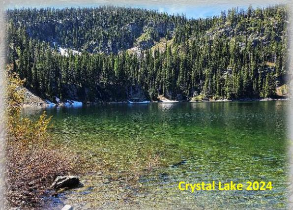
Crystal Lake 2024