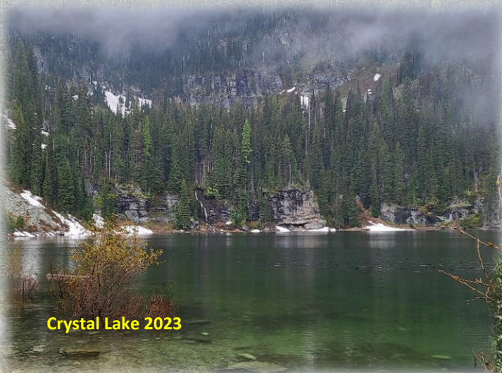
Crystal Lake 2023

The trail does cross the outlet and then continues up the hill. This will take you past the primitive trail to Rudie Lake and eventually ends on the state line road (#391) in a little over 2 miles. This is a nice day hike if camping for a couple days at Crystal Lake.