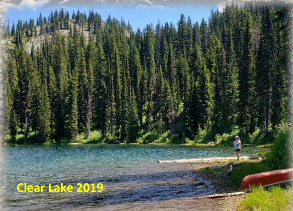
Clear Lake 2019

there, a moose was hanging around the far shore for most of the time we were there. The lake is shallow near the shore, so it is easy to wade out for fly casting. The shoreline itself was mostly free of any brush and easy walking.