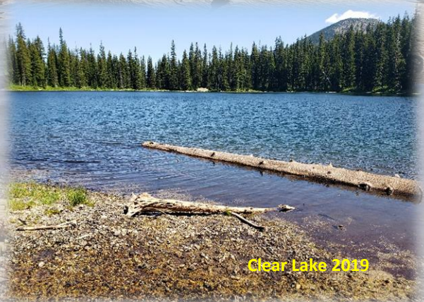
Clear Lake 2019

At the Lake: The last and only time I have been to this lake there was a canoe sitting along the shoreline. Quite a feat to get that down from the trailhead. There are several camping sites around the lake and the shoreline is easy to get around. The fishing was poor with little more than 6-inch trout available. The day my wife Kathy and I were