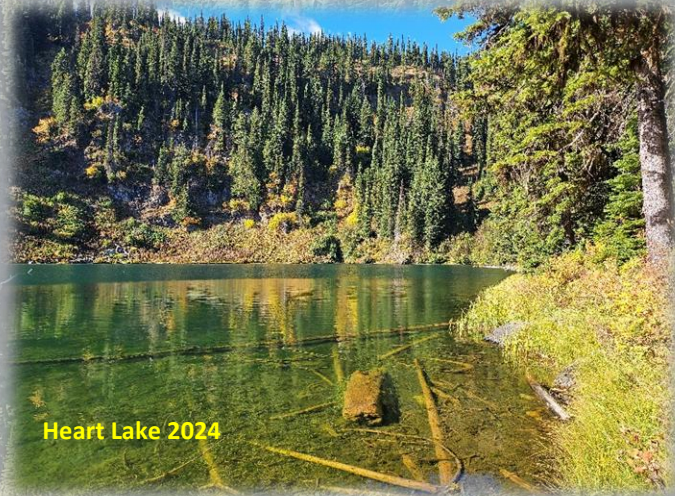
Heart Lake 2024