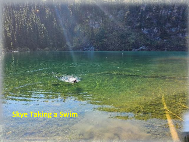
Skye Taking a Swim