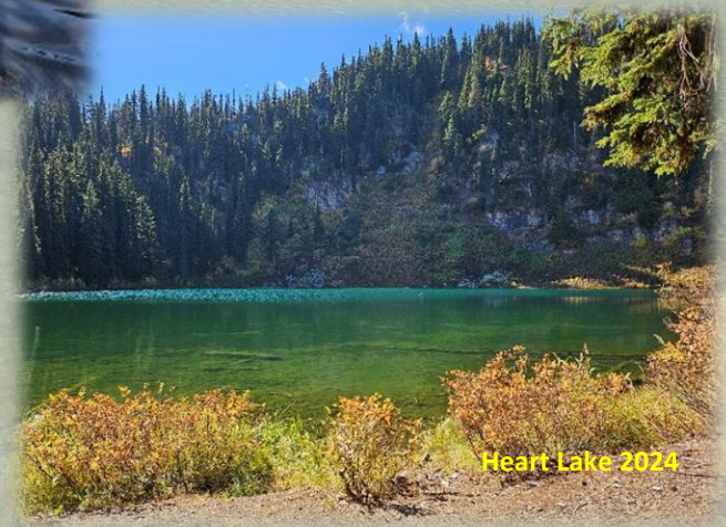
Heart Lake 2024