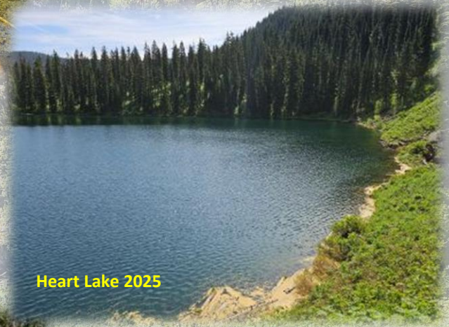
Heart Lake 2025