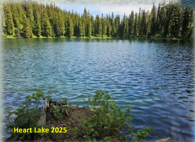
Heart Lake 2025