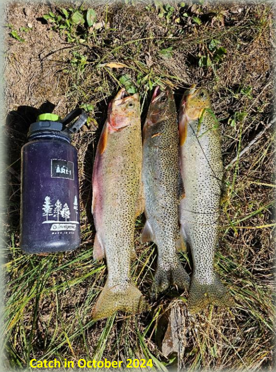
Catch in October 2024

campsite to the right of the outlet as the trail arrives at the lake. The site looks to be hammock friendly for those that use them instead of ground tents as there is a little band of trees that would look to fill that purpose. Fishing is usually good for Cutthroats as I catch fish every time I have fished this lake. Stocking is on a 7-year interval and 2019 was the last stocking. Generally speaking, this is a lake you can get away from everybody else as it is out of the way and a difficult climb. The trail has changed over the years as I remember the first time (1984), I went into the lake the trail itself did not follow the outlet stream straight up the hill.