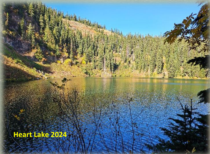
Heart Lake 2024