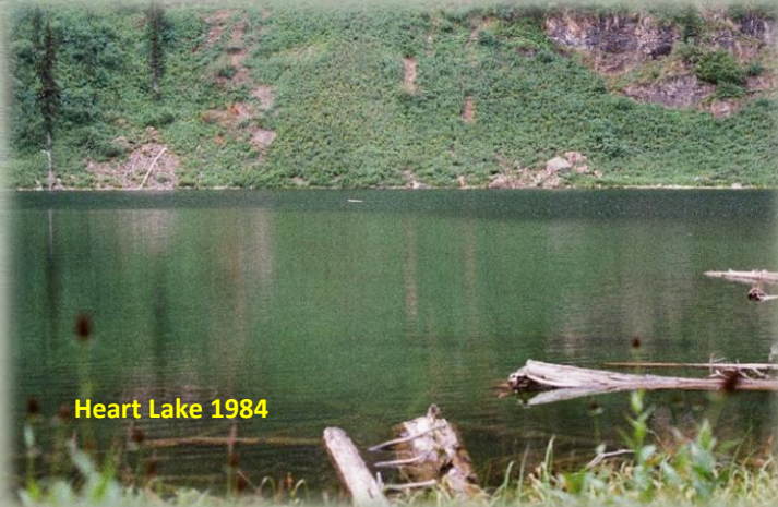
Heart Lake 1984

There is no signage for the trail but is #259 on topo maps. The trail starts out as an old road with a gentle grade (just to fool you); after a 1/4 mile the old road turns right and quickly becomes a trail and heads right up the hill. The trail is very steep and sometimes slick as you follow the outlet creek closely up the drainage headwall. The whole