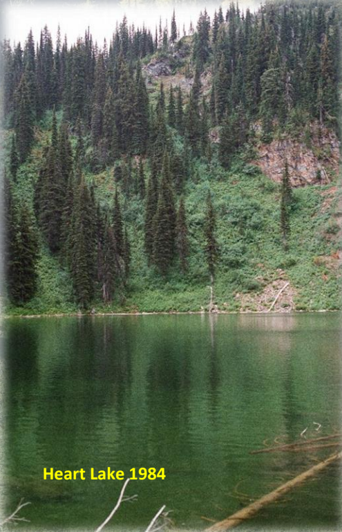
Heart Lake 1984