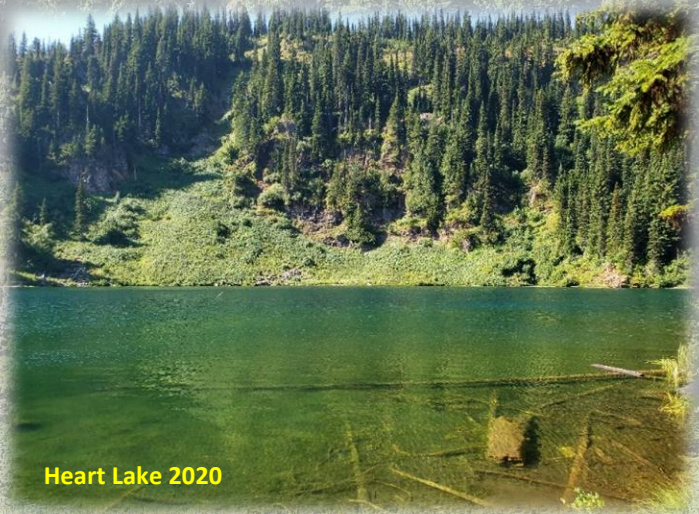
Heart Lake 2020

It will take 30-45 minutes to make the climb, the hotter the day the worse it is. Be careful coming down the trail as there are sections with loose rocks that like to roll under your boot and the section by the outlet creek is always greasy slick. It may actually take you longer to come down from the lake than to go to Heart Lake.