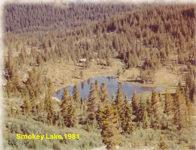
Smokey Lake 1981

Hike this road, bearing left and up after 1/3 mile; the stateline and trail number #738 is about 1 mile from the trailhead. Once on top of the stateline there will be an old road that takes off to the left, this is part of the stateline trail #738. Not all maps have trail #738 on them; Google Earth and the Lolo National