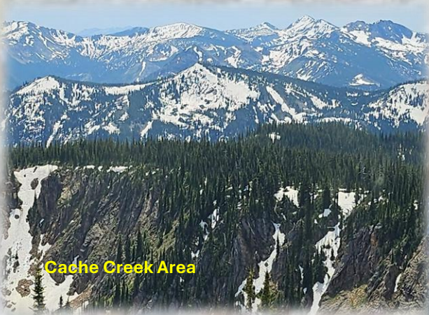
Cache Creek Area