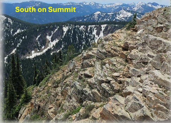
South on Summit

Follow the old road left around the hillside to the summit; it is growing in for lack of maintenance.