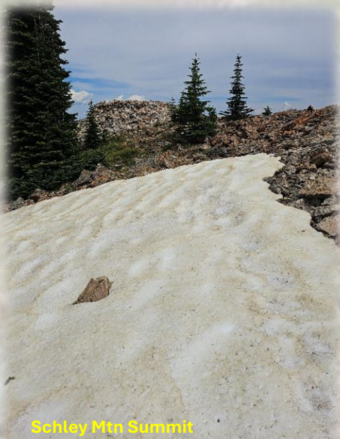
Schley Mtn Summit

toilet. This trailhead and campground are dry, so bring plenty of water if camping. This is not the actual end of the road.