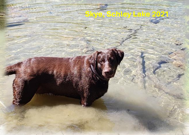
Skye, Schley Lake 2021

deepest area, but getting there requires going through a boggy area or up on the hillside a bit.