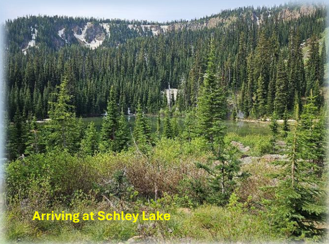
Arriving at Schley Lake