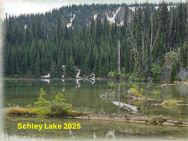
Schley Lake 2025

At the Lake: The lake is shallow and contains no fish, just frogs, snakes and bugs (lots). Haven't seen any game at the lake, but I would imagine that moose frequent it as there are lots of tracks in the mud. I didn't see any campsites, but it is fairly flat around the lake so there are places in the trees to pitch a tent. I think the far side by the rocks is the