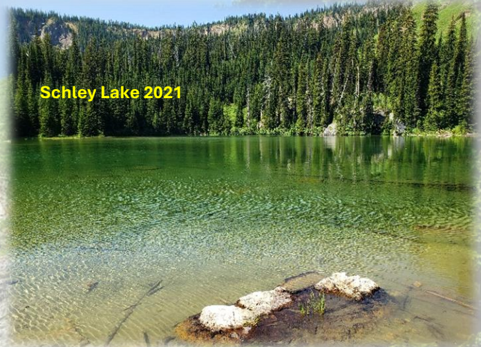
Schley Lake 2021

From the Schley Mountain trailhead walk back down the road for a quarter mile or so. Look for an obvious unmarked trail that drops off the road and heads down to North Montana Lake. Once at North Montana Lake, head over to the outlet streambed; this is the easiest route down to Schley Lake. The streambed is almost always dry and relatively free of brush and debris. If early in the year, the immediate area to the sides are good options. Eventually, you will pick up a trail through the trees that will take you to the lake. It was hot the day my son and I visited the lake, so we opted to climb back up through the trees to have some shade. I did the same route in 2025 when I revisited the lake.