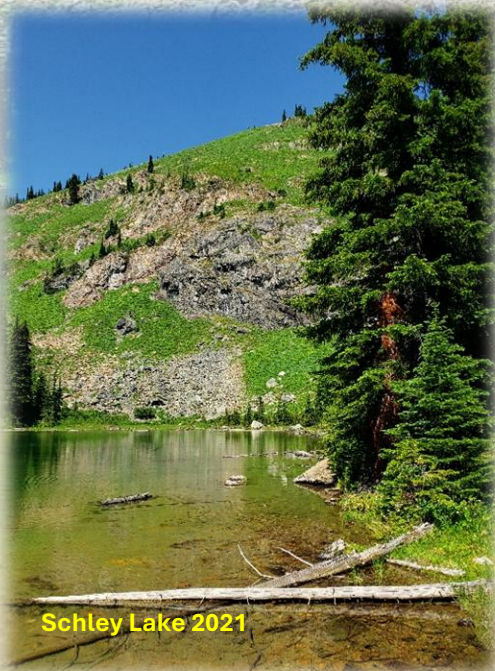
Schley Lake 2021

Surveyor Lake trailhead at 8.5 miles. The Schley Mountain Trailhead has several places to camp and park along with a vault toilet. This trailhead and campground are dry, so bring plenty of water if camping. This is not the actual end of the road.