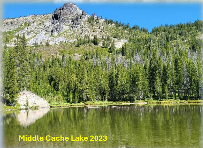
Middle Cache Lake 2023

From what I understand the trail is not maintained past this point and is hard to follow. I talked to a Game Warden in 2023 and he indicated that the trail is difficult to follow past that camp. The one time I hiked the from North Cache Lake, the trail was in good shape, but that was almost 40 years ago. This will be a difficult 2 miles to the lake if the trail is not available as the climb is around 1,300 feet. The trail is probably there in some fashion as there is evidence of it by the lake and beyond, although not great.