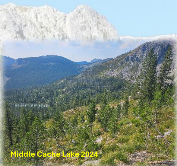
Middle Cache Lake 2024

At the Lake: Middle Cache Lake is on the small side and very shallow, no more than 10 feet at its deepest. However, it does appear to support a robust trout population, which I was surprised to see as everything that I have seen from the Montana Fish and Game indicates no stocking or fish