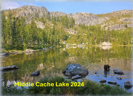
Middle Cache Lake 2024

About a half mile from Leo Lake there is a prominent rocky outcrop about 20 feet above the trail. Make sure you take a few minutes here, this is just an unbelievable view of