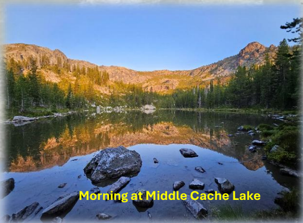
Morning at Middle Cache Lake

In 2023, I did continue up a trail that I believe is the old Upper Cache Creek Trail, but it kind of disappeared after a half mile or so. In retrospect and from what I found in 2024, this was not the Cache Creek trail. Most topo maps show the outlet stream from North Cache Lake entering the lake, this is not accurate as the North Cache Lake outlet bypasses the Middle Lake entirely. The inlet stream comes from one of the large basins