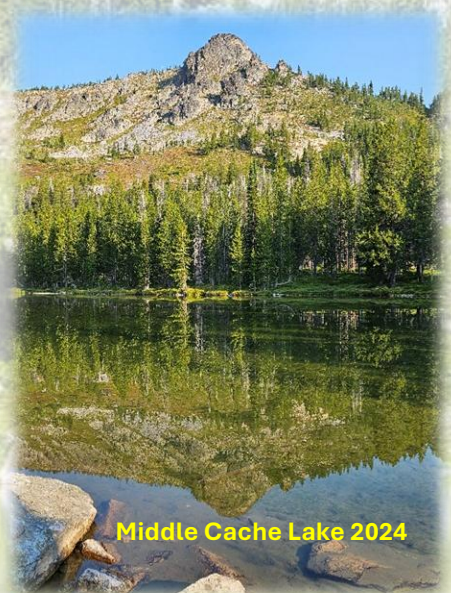
Middle Cache Lake 2024

The fish weren't that big (8-10 inches), but they were rising all over the lake. I was expecting to find at least some evidence of campsites but there was none. It is flat on the North side of the lake with a parklike feel in the pines. This is a lake similar to Kelly Lake that would be a good choice for those that want to go a little farther and not see anyone else for several days. Middle Cache doesn't look like much from above, but it has a nice shoreline, good sunrises and great background.