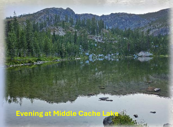
Evening at Middle Cache Lake