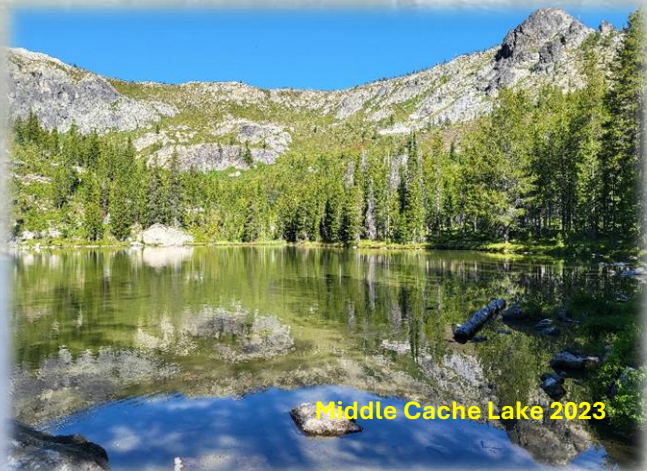
Middle Cache Lake 2023

NOTE: There is a spring at the base of this rocky outcrop. Find the best way down toward the inlet of the lake. There isn't much brush or deadfall along the way, so it is good going. You