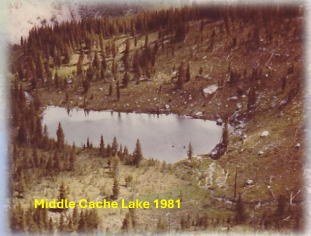
Middle Cache Lake 1981

The road behind the gate is designated by the Forest Service as a non-maintained road. The Forest Service does not maintain or brush out this road. If you are the first one through the gate in the summer, then expect to saw out the downed trees from the winter storms if you want to drive the 3 miles to the end of the road and the old trailhead. The road is pretty good until you reach the 2 switchbacks, and the road gets decidedly