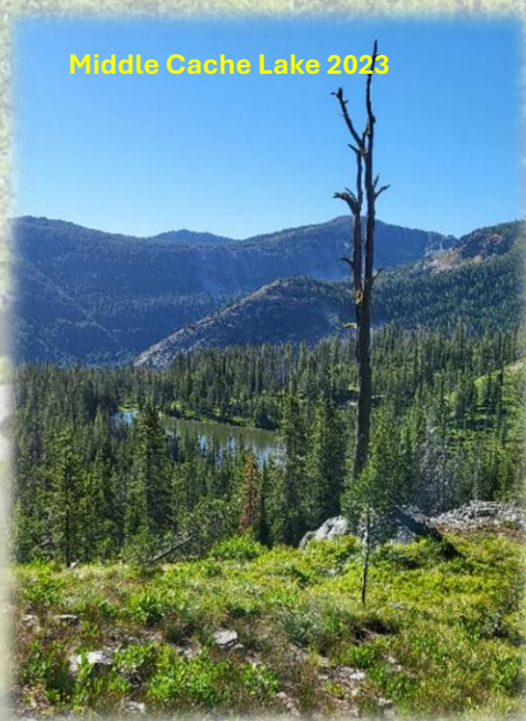
Middle Cache Lake 2023

A good trail continues around the right side of the lake and climbs steeply up towards the prominent saddle. The trail crosses a small stream (inlet to Leo Lake) and stays along the left hillside as it climbs continuously to the state line. This portion is just a primitive trail, so don't expect too much here. The farther up the hill, the worse and steeper the trail gets. North Cache Lake is virtually on the state line 450 feet above Leo Lake, The lake is a stone's throw down the hill. This is the highest lake along the state line that are included in these descriptions.