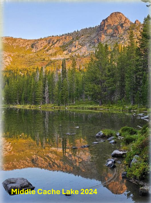
Middle Cache Lake 2024

Follow the old road, which is getting grown in, for 1/2 mile; there are some great views of Irish Basin with Cache and Pebble Creek in the background, take a minute or two here. The trail splits on the ridge with the better trail swinging right around the hillside and a more primitive trail going up the rocky ridge. Stay on the right-hand trail for another 1/2 mile, climbing up and around the rocky hilltop.