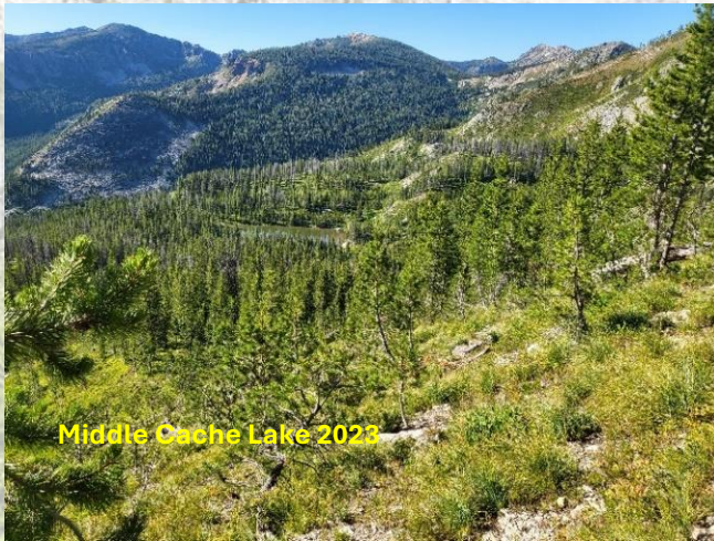
Middle Cache Lake 2023

should pick up the main trail (I think) out of Cache Creek just about the same time you get to the lake and follow it around to the outlet. Most maps do not show the Cache Creek trail that goes all the way to the state line and connects with the trail from Rhodes Peak. There is good reason for this as the trail is not maintained and is very difficult to find above the hunting camps in main Cache Creek.