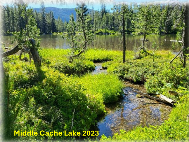
Middle Cache Lake 2023

worse from there for the last mile. Currently, there are very limited places that 2 full sized vehicles can pass, someone may have to back up several hundred yards or more to find a spot wide enough. The trailhead has plenty of room for parking and several camping sites; the ridge trail #110 from Schley Mountain connects back to the road. The road continues beyond the gate.