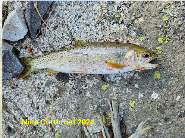
Nice Cutthroat 2024

upper Cache Creek, Granite Peak and Pilot Knob in the distance. Cache Creek is an expansive drainage system. Continue for another 1/2 mile to Leo Lake for a total of about 5 miles. The trail from the water stop to Leo Lake has deteriorated over the years, due to lack of regular maintenance and use. There is a lot more deadfall and many small trees are now growing in the trail itself. However, I have found that horse packers do clear out some of the trees blocking the trail, but it is not regular maintenance.