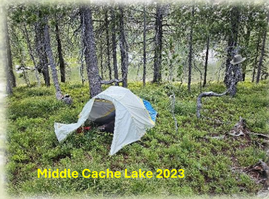
Middle Cache Lake 2023

should pick up the main trail (I think) out of Cache Creek just about the same time you get to the lake and follow it around to the outlet. Most maps do not show the Cache Creek trail that goes all the way to the state line and connects with the trail from Rhodes Peak. There is good reason for this as the trail is not maintained and is very difficult to find above the hunting camps in main Cache Creek.