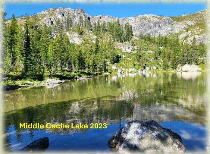
Middle Cache Lake 2023

Hike this road, bearing left and up after 1/3 mile; the stateline and trail number #738 is about 1 mile from the trailhead. Once on top of the stateline there will be an old road that takes off to the left, this is part of the state line trail #738. Not all maps have trail #738 on them; Google Earth and the Lolo National Forest maps do not, very few older