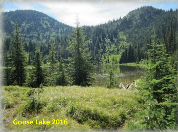
Goose Lake 2016

At the Lake: Goose Lake is just a pond that is frequented by Moose, Elk, Deer, and Wolves among many others; but fish are not on the list.