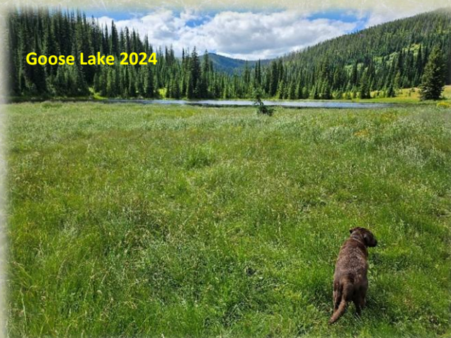
Goose Lake 2024

There is a little bit of a break above Dalton Lake but then the trail continues to climb to the high point of 7,250 ft. From there you lose almost 1,500 ft to Goose Lake. This route is a bit longer than the Hoodoo Pass route with water available at least to Pearl Lake but you are climbing steadily (mostly) for 6 miles. Kind of a pick your poison when hiking from the Trout Creek side. The hike from Heart Lake trailhead to the high point is a bit of a grind if completed it in a day with a full pack.