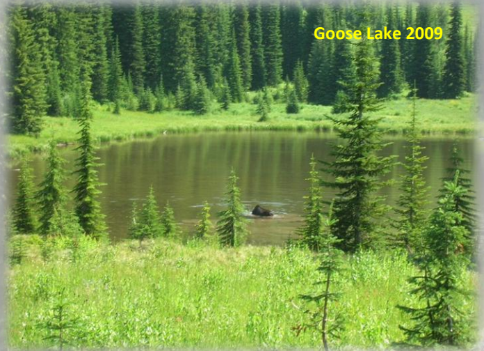
Goose Lake 2009

pavement where the road changes to Trout Creek Road (#250). Continue up Trout Creek Road (~14 miles) to the Heart Lake Trailhead. There is a vault toilet and parking for over 20 vehicles. Trail #171 takes off on the far side of the parking area. The trail wanders through the bottoms, gradually climbing up the valley for 2+ miles. Then the trail turns up the hill and climbs much steeper for the next 3/4 mile to Heart Lake.