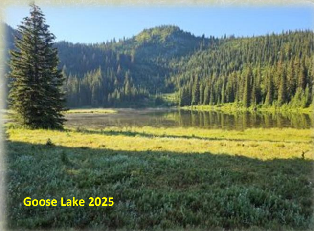
Goose Lake 2025

There are 2 main camping sites around the lake. This is a major horse camp during the late summer and fall so things are kind of beaten up by the horse and mule traffic. The better camping site and water are over by the inlet, the water at the outlet is warm and does not taste clean. It passes muster if filtered but not the best. However, this is a good basecamp for day trips into the Trios or climbing Crater Mountain.