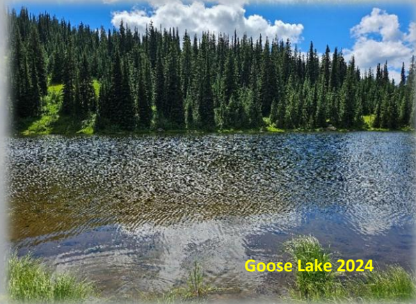
Goose Lake 2024

Getting There: Take the Fish Creek Exit on I-90 and proceed up Fish Creek Road #343, then the right fork on road #7750 (Iowa State Research Center) that ends at the Clearwater Crossing in 6.75 miles. The clearwater crossing has a small campground (3 sites), 2 vault toilets and a Forest Service Guard Station. Take trail #103 that takes off to the right of the Guard Station on an old road. Stay on this trail for about 11 miles passing the Greenwood cabins and crossing French Creek over that span.