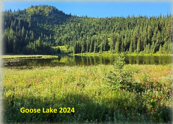
Goose Lake 2024

trail then starts heading down to Goose Lake (5,800 ft), this is the first available water since Hoodoo Pass except for some possible snowbanks along the way. The total distance to Goose Lake is a solid 7 miles. Even though the distance is a bit over 7 miles, it is a hard route as there are significant elevation changes across the state line trail, not a lot of shade and water is not readily available. If it is a hot day, the hike can be pretty hard.