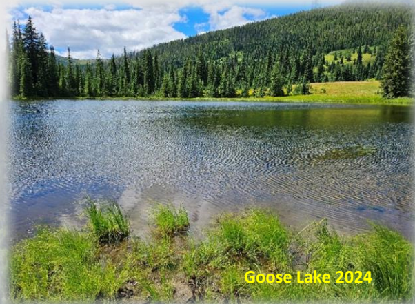
Goose Lake 2024

1/2 mile around Steep Creek and last mile after passing through the meadows. The trail through the meadows can be a bit difficult to follow, but the trail runs fairly straight across each meadow. I found in 2024 that there was a lot more brush than in the past, a lot of waist and occasional head high brush. If it has recently rained or is raining, it will be a wet hike (it was). The distance to Goose Lake is about 5.75 miles. There is plenty of water (~ 6 small crossings) on this trail so there is no need to carry water for the entire route as you do on some sections of the Stateline Trail.