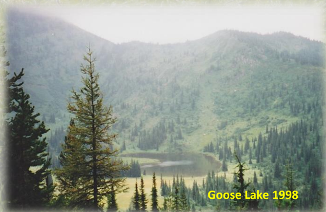
Goose Lake 1998

Continue up Trout Creek Road (~19 miles) until you top out on Hoodoo Pass on the Idaho/Montana border. Continue up Trout Creek Road (~19 miles) until you top out on Hoodoo Pass on the Idaho/Montana border. Continue on Road #250 into Idaho for about 11 miles. About a tenth (0.1) of a mile before crossing the Middle Fork of the Clearwater River, road #250 crosses Long