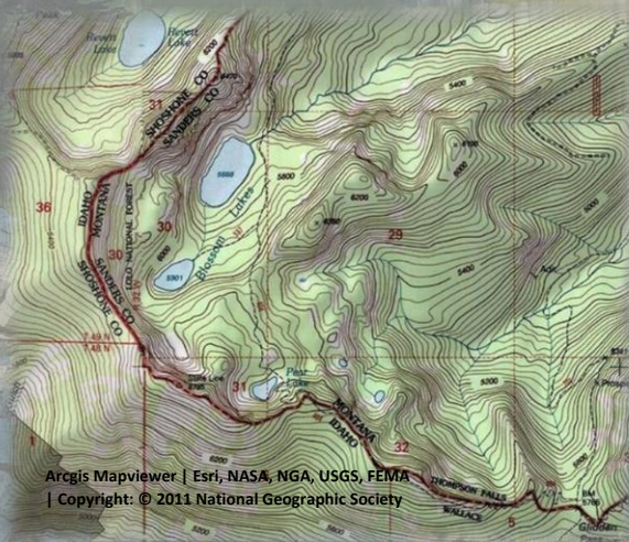
ArcGIS Mapviewer | Esri, NASA, NGA, USGS, FEMA | Copyright: © 2011 National Geographic Society

Getting There: At the top of Thompson Pass trail #404 takes off just on the Montana side of the pass. There is an interpretive sign there where the trail takes off from the parking lot. The trail starts flat as you walk on the remnants of an old road and along the old canal. The canal used to bring water from Montana to the mining activities on the Idaho side of the crest. It is about a mile of good walking and then you turn up the hill into a series of switchbacks. After a bit the trail lines out at a good grade for about 1.5 miles before you top out and drop