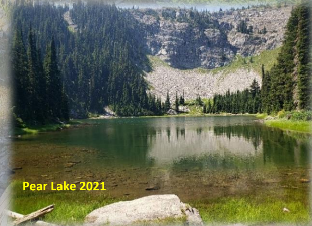
Pear Lake 2021

Except for a rocky outcrop and overlook, the entire trail is under the forest canopy and well shaded. There isn't any water along the entire route until just before Lower Blossum Lake, so bring enough water for yourself and your dog. Cross over the outlet and head along the lower lake on a good trail. Stay left on trail #404 at the half mile mark where