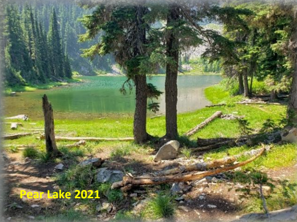
Pear Lake 2021

NOTE: The trail from Cooper Pass is open to motorcycles, it appears to be a popular route to Granite Peak as I have met motorcycles on the trail a couple of times.