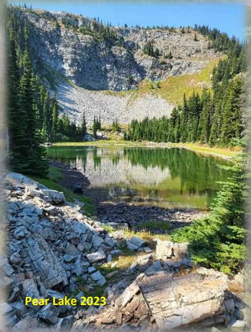
Pear Lake 2023

Alternative Route 1 – Burke: I rode my motorcycle from the power station trailhead (parking area) near Burke up the extremely rocky road to the Stateline Trail in 2021. This was about 5.5 miles one way; the road will beat you up with all the rock. The lower sections of the road are basically all river rock, but the whole road is very rocky. I eventually rode for a mile on a nice single track when the road ended. I was stopped directly above Blossom Lakes by a very steep and rocky section that I couldn't make with the bike I had and my bad hip. It was then just a 1.25-mile hike to Pear Lake, connecting with trail #404.