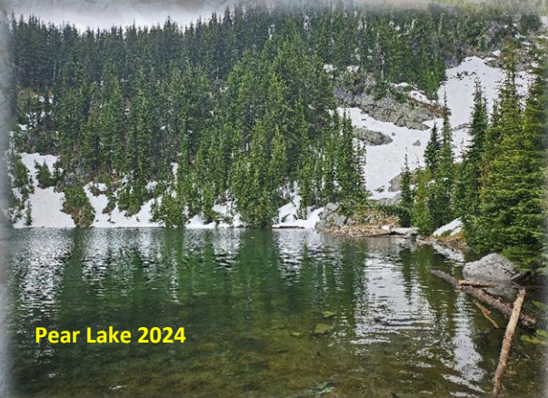
Pear Lake 2024