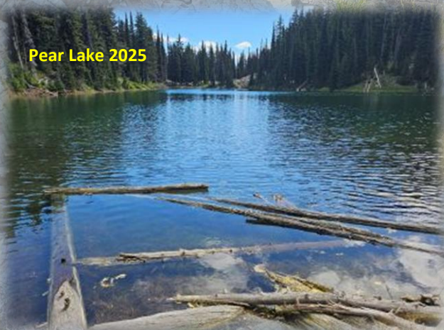
Pear Lake 2025