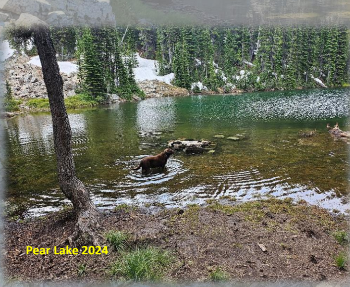
Pear Lake 2024

After a brief stroll, the trail will consistently climb for the next mile. You do get some good views of both Glidden Lakes with Stevens Peak in the background. After a mile or so the trail heads down the hill to give you a bit of a break, at the bottom you are close to the ridgeline and are able to walk over (Montana side) and view the small lake in that drainage before the trail heads back uphill. The trail then becomes a series of rollers for about a 1/3 mile before reaching the intersection leading down to Pear Lake. The intersection is marked by a