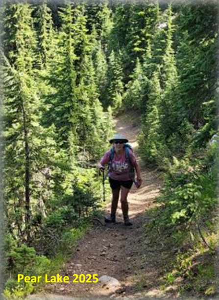
Pear Lake 2025