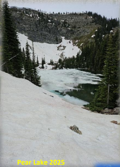
Pear Lake 2025