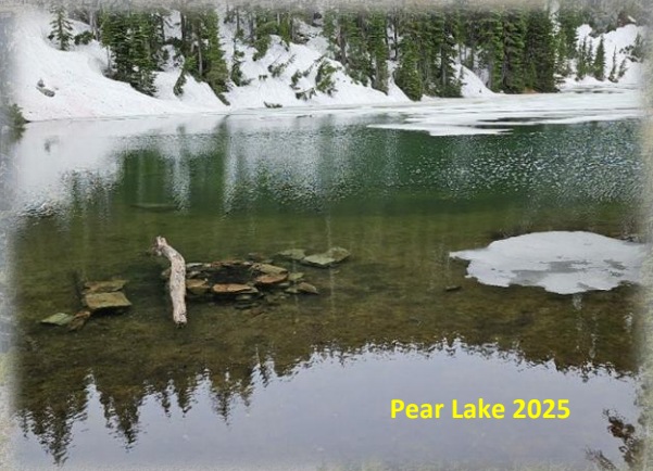
Pear Lake 2025