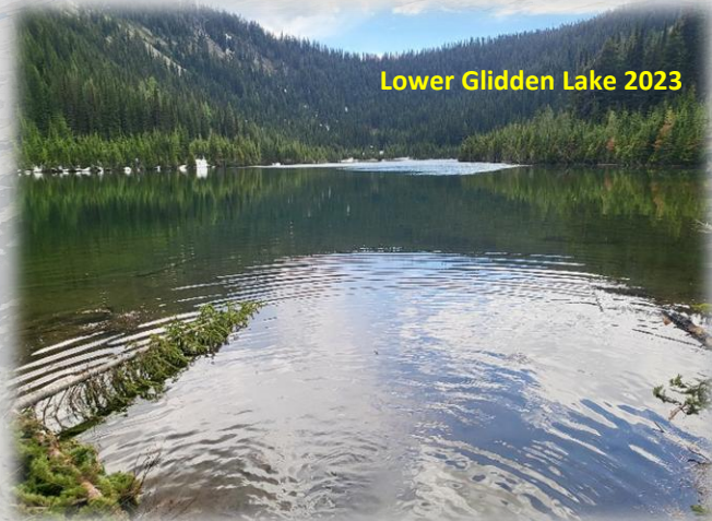
Lower Glidden Lake 2023