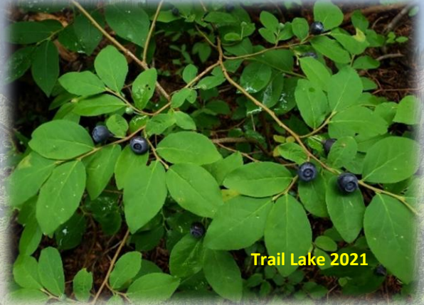
Trail Lake 2021