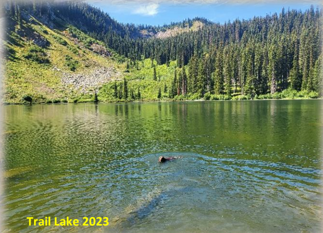
Trail Lake 2023

trail that heads down to a set of falls not too far into the hike. It is quite the climb down to the falls; there are 20-foot ropes to help get down to the falls. It would be difficult to get down the trail without them.