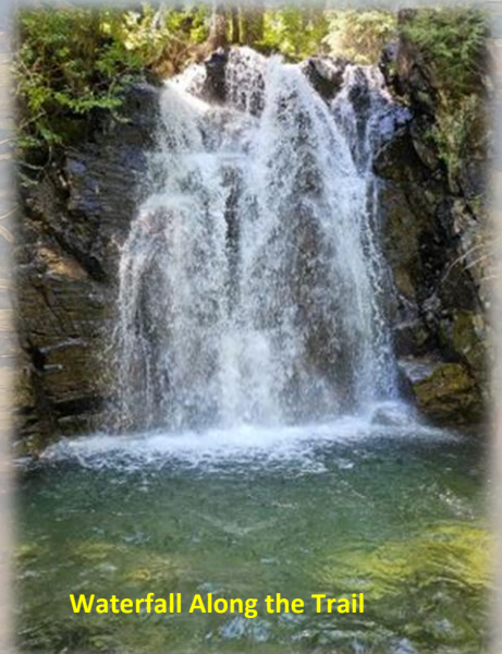
Waterfall Along the Trail