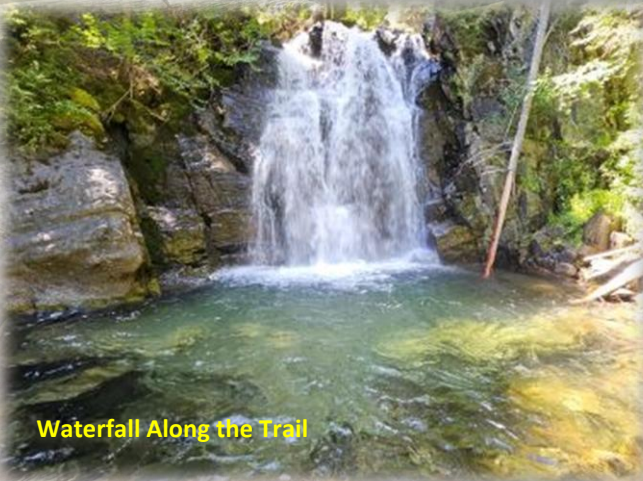
Waterfall Along the Trail