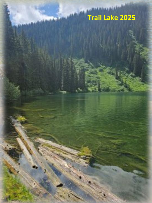
Trail Lake 2025