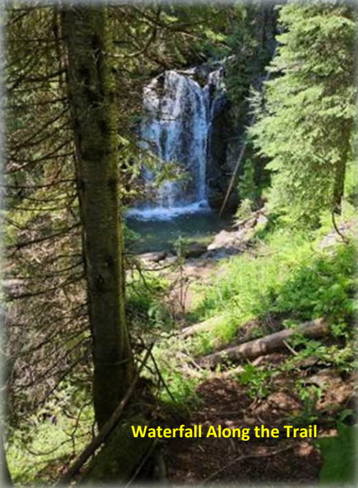
Waterfall Along the Trail

I fished from the main Trout Creek (bridge) to the trailhead when I was in my teens. It was a brushy and sometimes a hard climb up the creek, but I did well that day.