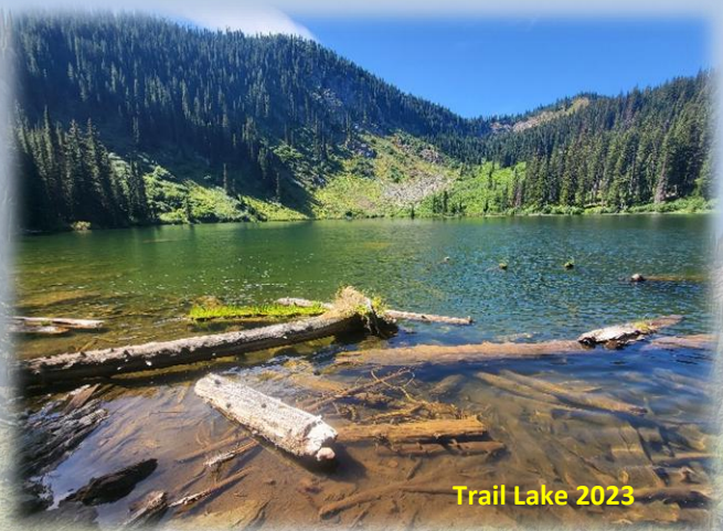
Trail Lake 2023

At the Lake: Fishing at the lake consists of Brook Trout and historically it was good fishing. The shoreline is very brushy and there are large areas of logs that block casting and are too waterlogged to walk out on. I would suggest a small raft is a