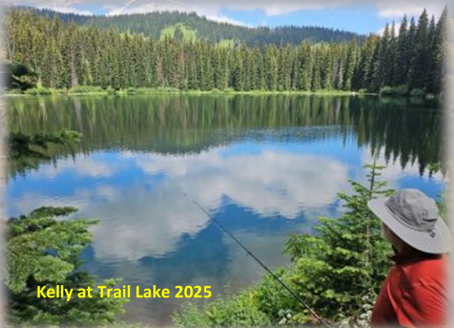
Kelly at Trail Lake 2025

Chuck & Steve Bauer and I skied into the lake one winter day in the early 80's. If you hit this lake at the right time late in the summer Huckleberry's are prominent along the trail and mellow sidehills towards the outlet stream.