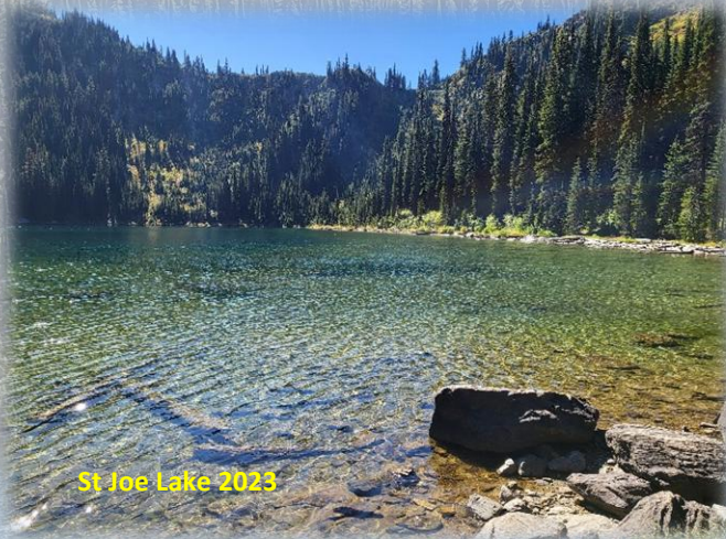
St Joe Lake 2023

I was kind of surprised at how beat up the camping sites are and that whole area of lake shore is. I didn't think this lake got that amount of traffic but apparently it does. I have only been there during the week, so I have never seen anyone else at the lake. I have read some excerpts from other sites that it is quite busy on the weekends and campsites can fill up.