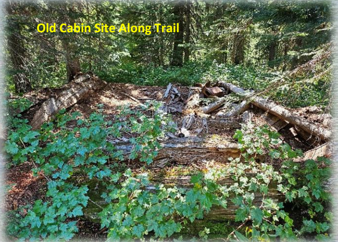
Old Cabin Site Along Trail