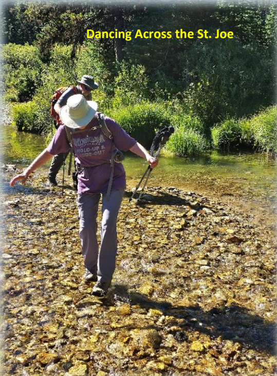
Dancing Across the St. Joe