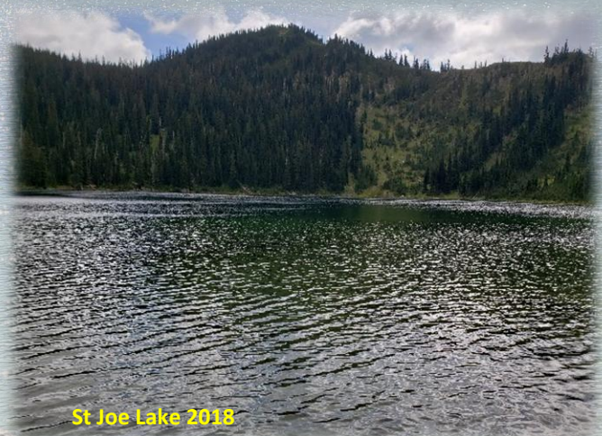
St Joe Lake 2018

Trail #49 is an old road for about a mile or so and crosses the St Joe River several times in the first couple miles, although the river is just a small creek at this point. I hiked this route in late August and was able to complete all the crossings without getting my feet wet. The trail is very easy for the first 2 miles and then starts to climb up the drainage to the lake. The only really steep section is the climb around Rambikur Falls that occurs in the last mile to the lake which is the official headwaters to the St. Joe River.