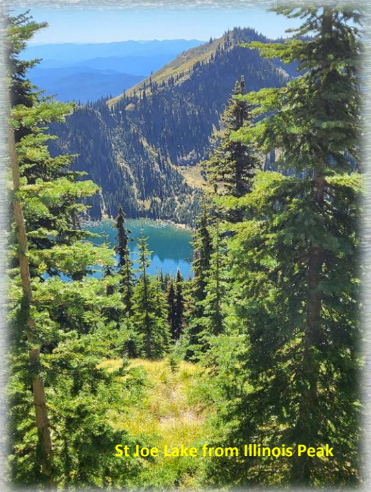
St Joe Lake from Illinois Peak

I have seen parties do a shuttle from Cascade Pass to the St. Joe River Trailhead and then complete a point-to-point hike of approximately 10 miles. A good adventure would be to visit Graves, Illinois, and Gold Crown peaks in a day. There is a marginal and brushy trail to the low notch on the south side of the lake. From there climb the ridges to Graves Peak, then Illinois and Gold Crown. Returning to the lake to close the loop. I have not completed this but have read a description of it.