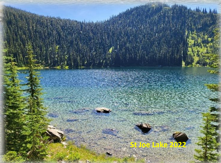
St Joe Lake 2022

Getting There: From Superior, take Cedar Creek Road #320 and head toward Missoula Lake and Cascade Pass, 25 miles; stay on the main road as there are several other roads that connect. After coming off Miller Saddle, (about 20 mi) there will be an intersection at the bottom of the