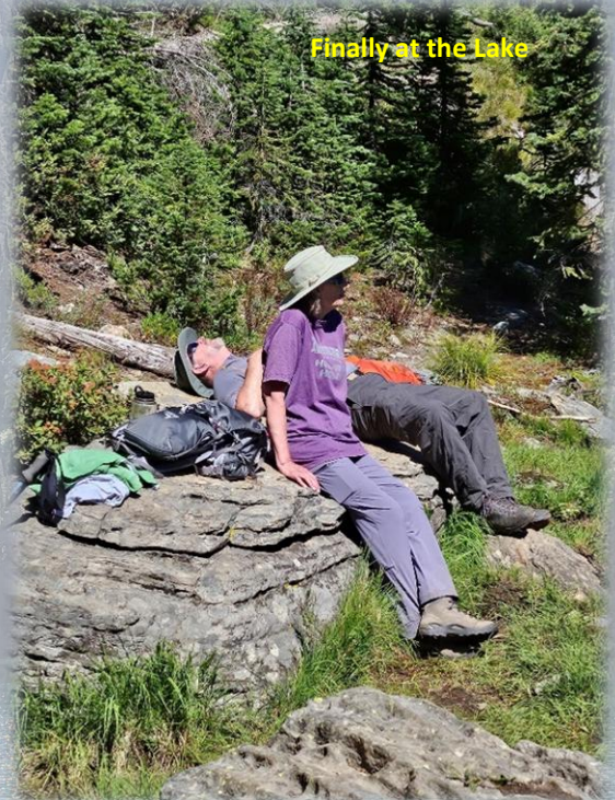
Finally at the Lake