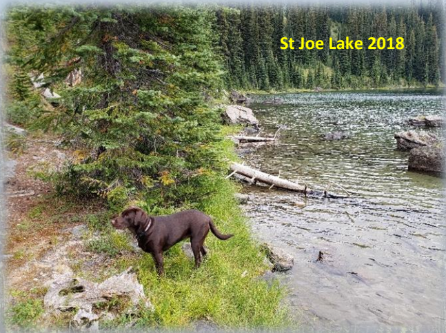
St Joe Lake 2018

drainage. Stay straight crossing Oregon Creek. The right fork at this intersection (road #7763) heads down the hill to the Big Flat; the left fork will take you up to the Oregon Lakes trailhead (1/2 mi). Continue past Missoula Lake to Cascade Pass (Missoula Lake saddle).