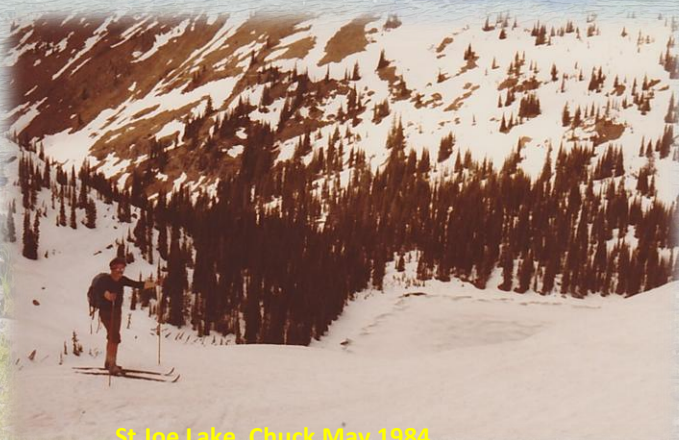
St Joe Lake, Chuck May 1984

At the Lake: St Joe Lake is of decent size with a walkable shoreline most of the way around the lake. Fishing for Cutthroats can be good at times, but it has been hit and miss for me the couple times I have hiked in. I have not spent the night there, so I have been fishing mid-day rather than early in the morning. There are multiple campsites in and around the outlet area. It looks like 5-7 parties can be accommodated.