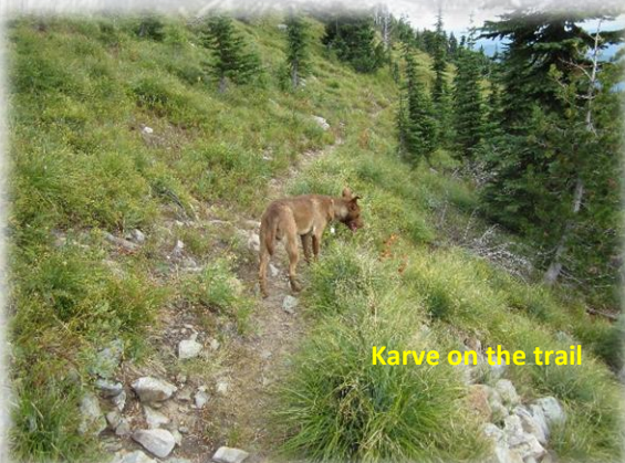
Karve on the trail