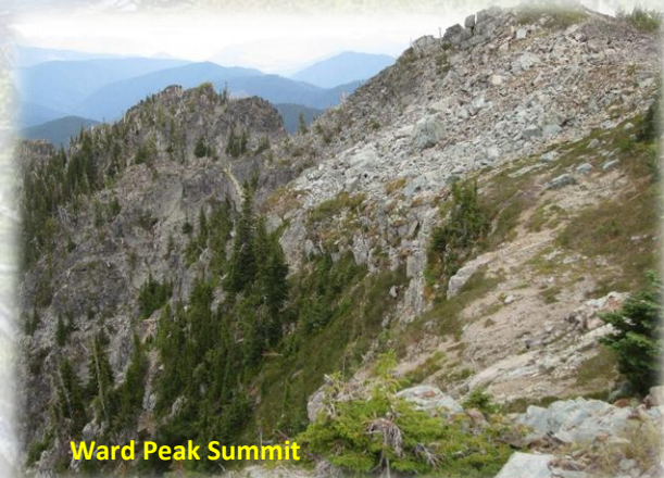
Ward Peak Summit

Continue straight on trail #280 that heads back along the hillside to a couple of switchbacks before the trail lines out for Hazel Lake. The trail has plenty of water for