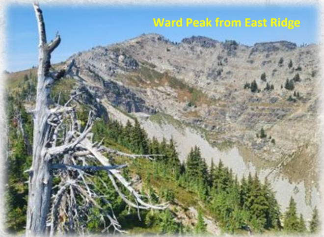
Ward Peak from East Ridge