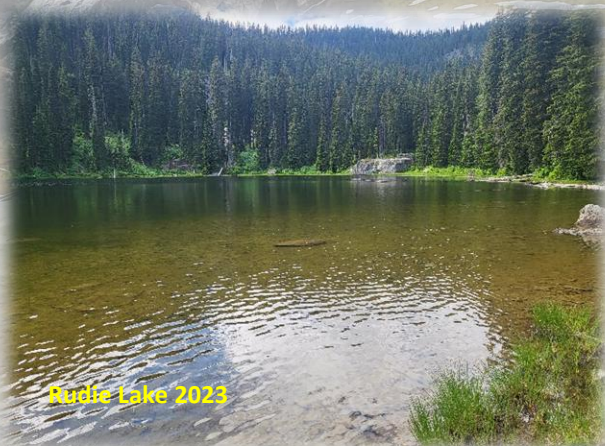
Rudie Lake 2023

This primitive trail is at a low point on the ridge where the main trail is actually on the ridge about a mile from the road. Trail #269 then heads away from the ridgeline and goes around the hillside and eventually down to Crystal Lake 1.2 miles from the primitive trail.