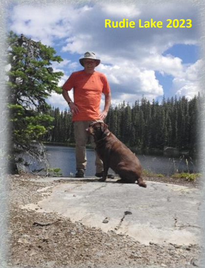
Rudie Lake 2023

At the Lake: Rudie Lake is not very large. It is brushy and the immediate shoreline can be swampy, but you can work your way around the lake with a little bit of effort. I found 2 campsites while I was there, one on the small peninsula and one on the large prominent rock on the southern end of the lake. The campsite near the peninsula doesn't look like it has been used in a while.