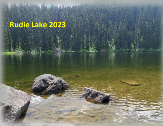
Rudie Lake 2023

The other campsite by the inlet is on a large flat rock, there is enough room for 2 or 3 tents. This campsite looks to have been used in the past couple of years as there are some fresh cut logs around the fire ring.