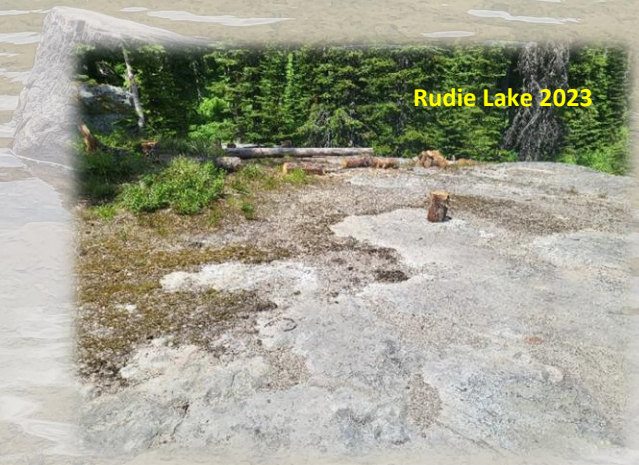
Rudie Lake 2023