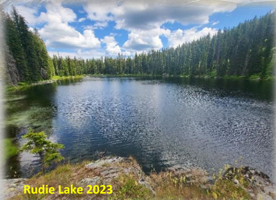
Rudie Lake 2023

Alternate Route: You can also get to Rudie Lake from Crystal Lake. Trail #269 to Crystal Lake continues up the hill past Crystal and will end at state line road #391. You would take the same primitive trail down to Rudie Lake. This option shortens the driving time by coming up Deer Creek but doubles the hiking distance.