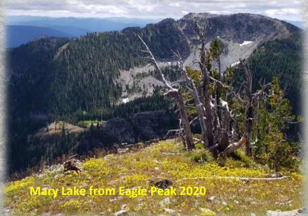
Mary Lake from Eagle Peak 2020

When you get to the dividing ridge between Mary Lake and Hub/Hazel lakes dive off there and find the best route you can take down to Mary Lake. There is no trail, and it is steep. It is tempting to try and stay on the rocky ridge, but when my son and I looked it over, it seemed that there would be some places that would have been more difficult than the green draws that we eventually used. At the time I was on schedule to have hip replacement surgery in a couple weeks, so this trip was difficult.