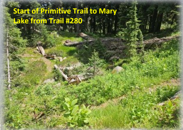
Start of Primitive Trail to Mary Lake from Trail #280