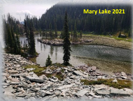
Mary Lake 2021

Take the Ward Peak trail (#250) and stay to the right (upper) at the trail split. The lower trail (#250) is the Up Up Mountain ridge trail that will take you over Eagle and Gold peaks and eventually to the road to Up Up Lookout. The upper trail is not numbered and will take you to the summit of Ward Peak.