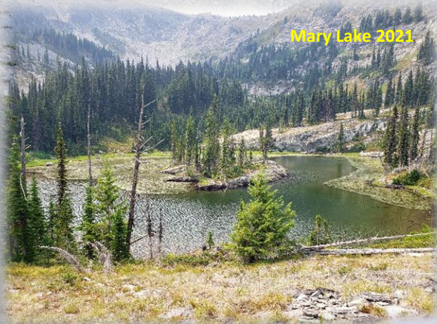
Mary Lake 2021