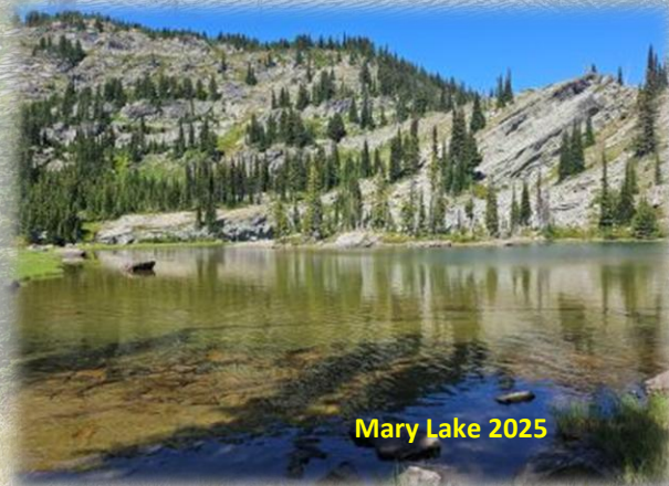
Mary Lake 2025