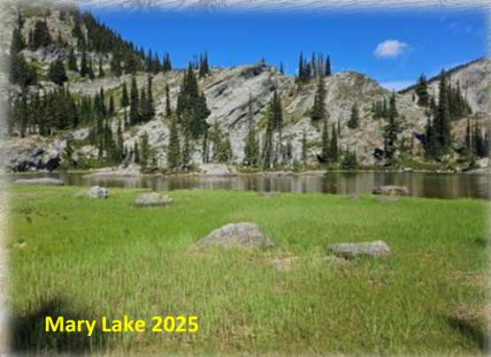
Mary Lake 2025

Hub Lake outlet creek and then immediately goes back up and then quickly arrives at the lake.