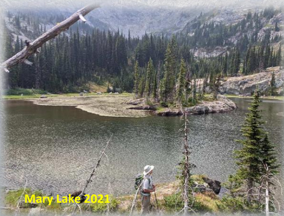
Mary Lake 2021

The climb from Hub Lake is mostly open until you get about 1/2 mile along the route and enter the trees. After about 0.1 miles into the trees you will come to a well defined and open small bench and the trail will immediately switchback up the hill to the right. To your left are several large downed trees (see pictures in gallery below); go around them on the left and the trail to Mary Lake starts back up as the downed trees cover the