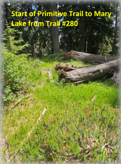
Start of Primitive Trail to Mary Lake from Trail #280

times brushy. There are several short sections of swampy / boggy areas along the way. Don't overthink these as the trail picks up again directly across the areas, just go straight across the wet areas as best you can. There is a good spring about halfway across the traverse that has enough volume to filter.