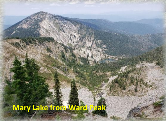
Mary Lake from Ward Peak