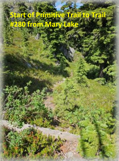
Start of Primitive Trail to Trail #280 from Mary Lake