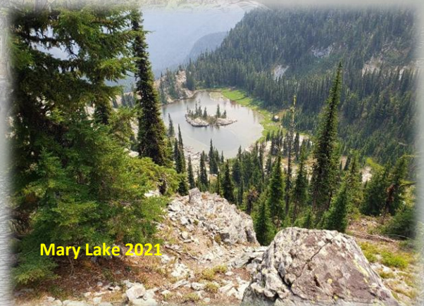
Mary Lake 2021

Continue straight on trail #280 that heads back along the hillside to a couple of switchbacks before the trail lines out for Hazel Lake. The trail has plenty of water for your dog, so no need to take extra. Hazel Lake is about 3 miles from the trailhead. From Hazel Lake continue up the main trail. It is less than a mile up to Hub Lake with an elevation gain of less than 400 feet. The trail takes a sharp dip for a couple hundred yards to cross the