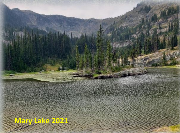
Mary Lake 2021

Getting There: Take the Ward Creek Road (#889) exit off I-90. The exit is only accessible from the East bound lanes and sits right on a sharp corner, if not paying attention you could miss it. Drive approximately 6 miles to a switchback and bridge across Ward Creek where there is a sign for the trailhead and ample parking. Hub Lake 2022 Stay on the main road, you will pass the road that leads to Up Up Lookout at mile 3. The lookout is rentable, but not recommended for small children for safety reasons.