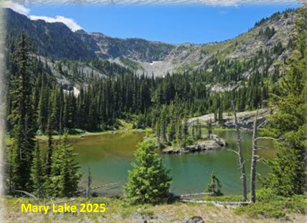
Mary Lake 2025

Follow the same route out that you took to get to Mary Lake but do take the time to go to the top of Ward Peak, either on your way in or out of Mary Lake. The peak is one of the tallest for this area of the state line and has some very good views. There are remnants of the lookout tower (cabin) that sat there years ago. You can also take the primitive trail from Mary Lake to trail 280, then up 280 to trail #250 and back to the Ward Peak Trailhead.