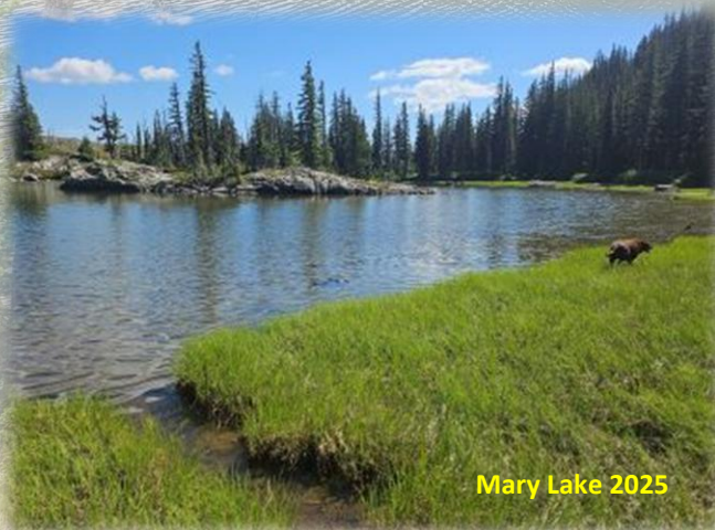
Mary Lake 2025