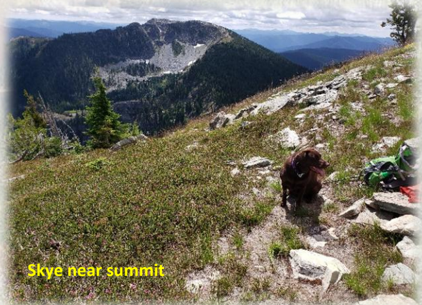
Skye near summit

Take the Ward Peak trail (#250) straight up the hill from the road. The trail is obvious as there has been motorized traffic up the first 100 yards or so in the past. At about the 1/2-mile mark there will be a primitive trail to the left that heads back down towards the road; stay right. Not long after there is another split; with the right (upper) trail heading up to Ward Peak.