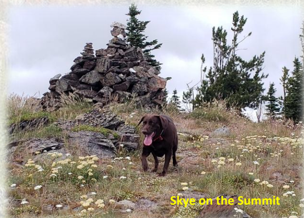
Skye on the Summit

Continue straight on trail #280 that heads back along the hillside to a couple of switchbacks before the trail lines out for Hazel Lake. The trail has plenty of water for your dog, so no need to carry extra. Hazel Lake is about 3 miles from the trailhead. From Hazel Lake continue up the main trail. It is less than a mile up to Hub Lake with an elevation gain of less than 400 feet. The trail takes a sharp dip for a couple hundred yards to cross the Hub Lake outlet creek and then immediately goes back up and then quickly arrives at the lake.