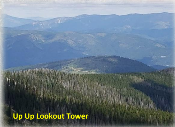
Up Up Lookout Tower

Trail (#262) starts out meandering through the bottoms and some cedar groves. The trail climbs moderately and after a mile or so you will get to a nice set of waterfalls. The trail splits at this point with trail #262 turning left steeply up the hill and back towards the state line; there is (was) a sign at the intersection. This is not a shortcut to Hazel Lake, nor does it go to Square Lake. Rather it ends up on the state line road (#391) about ¼ mile from the Square Lake trailhead. You can see portions of it along the hillside across the valley if you look closely.