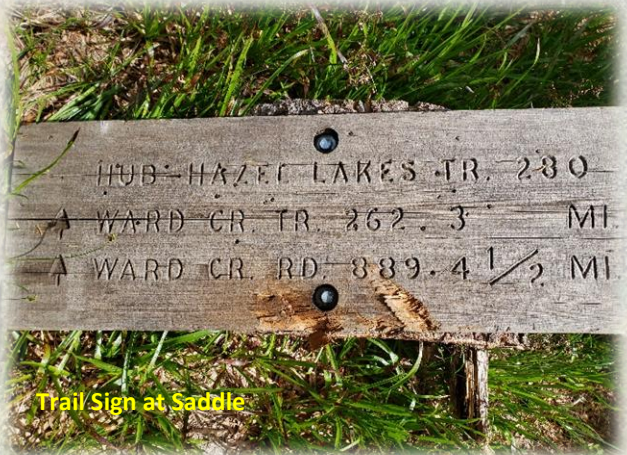
Trail Sign at Saddle