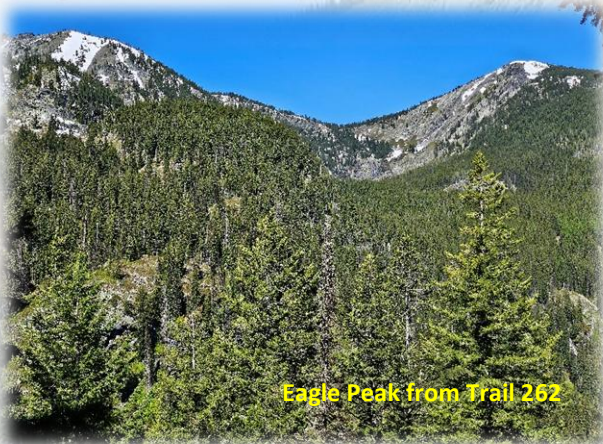
Eagle Peak from Trail 262

Continue around the right side of Hub Lake for the tough climb up to the saddle between Ward and Eagle Peaks. It is less than a mile, but it is a steep and rocky trail. Don't forget to walk over to the old mine opening that is a couple hundred feet up the hill from Hub Lake. Once at the saddle where trail #280 intersects with trail #250 turn right and head up towards Eagle Peak. You are still over 700 vertical feet from the summit, so it is a bit of a slog after climbing up from Hub Lake. There is very little relief over the distance to the summit. This is a tough route.