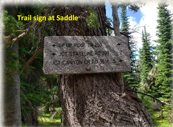
Trail sign at Saddle

The lower trail (#250) is the Up Up Mountain ridge trail that will take you down to the intersection of trail #280 coming out of Ward Creek, over to Eagle and Gold peaks and eventually to the road to Up Up Lookout. The trail drops moderately to the saddle between Eagle & Ward Peaks. You will intersect trail #280 coming out of Hub Lake. Stay straight and head up the hill. It is over 700 vertical feet to the summit with little relief along the way.