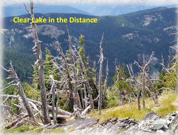
Clear Lake in the Distance

The trail immediately heads steeply up the ridge for a couple hundred yards before easing up a bit as it switchbacks up the ridge for about a mile. The trail then flattens out and follows along the ridgeline for another 3/4 miles, staying mostly on the right side. As the trail approaches Gold Peak, it swings over to the left side of the ridge and descends into the upper part of the small basin below Gold Peak. There is a small pond and water source there at mile 2.75. This is the only water source that I am aware of between the trailhead and the state line road #391.