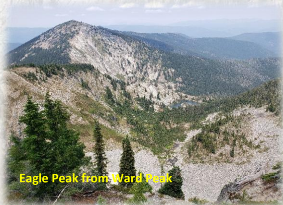
Eagle Peak from Ward Peak

Getting There: Take the Ward Creek Road (#889) exit off I-90. The exit is only accessible from the East bound lanes and sits right on a sharp corner, if not paying attention you could miss it. Drive (~6 miles) to a switchback and bridge across Ward Creek where there is a sign for the trailhead and ample parking. Stay on the main road, you will pass the road that leads to Up Up Lookout at mile 3. The lookout is rentable, but not recommended for small children for safety reasons.