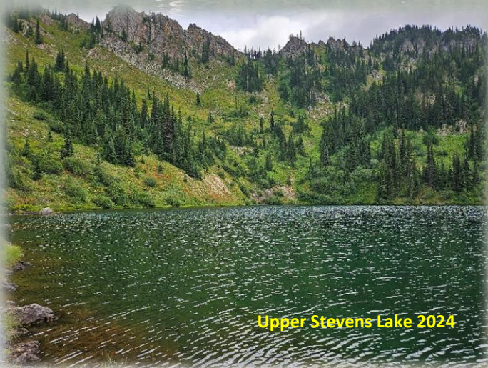
Upper Stevens Lake 2024