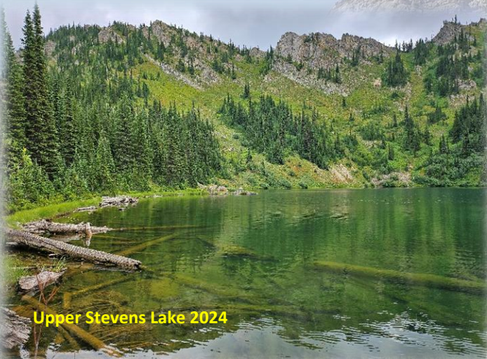
Upper Stevens Lake 2024