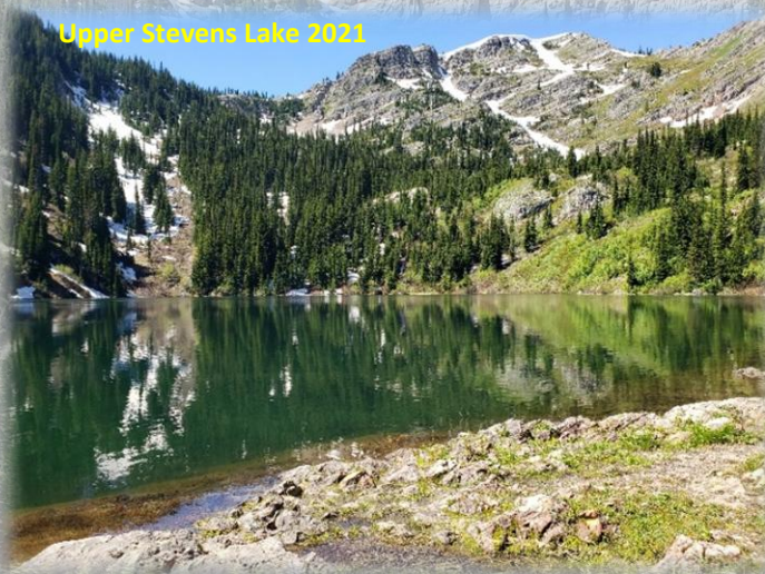
Upper Stevens Lake 2023

At the 1.5-mile mark you come to a creek crossing on the hike to the lake. This crossing can be very slick on the logs set across the span and could be problematic if there is too much water, so be careful. It is not a good place to take a fall. On the other side of the crossing there is an obvious trail to the left that takes off straight up the hill. This is a cutoff trail and not the main trail. It is very steep and in poor condition.