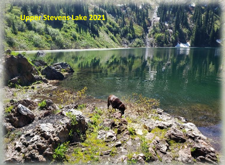
Upper Stevens Lake 2021