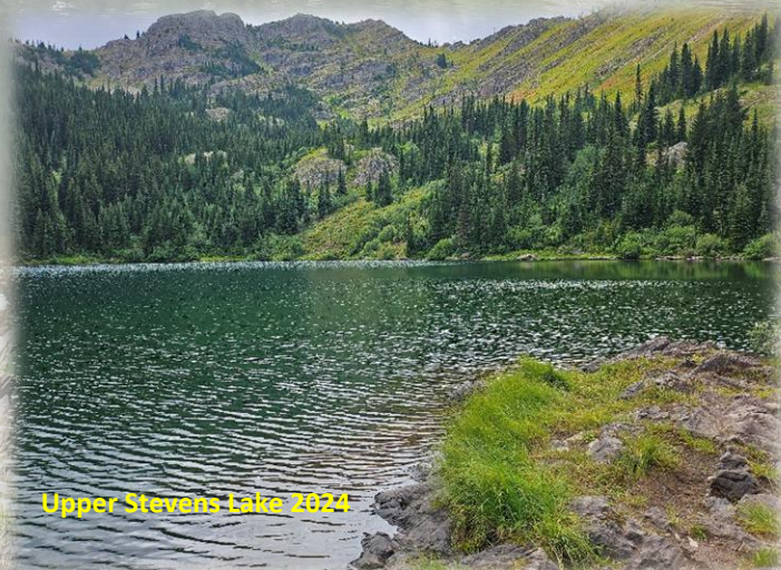
Upper Stevens Lake Z624

switchback; there is a trail number sign here at this intersection. The trail continues up with several switchbacks for about a mile.