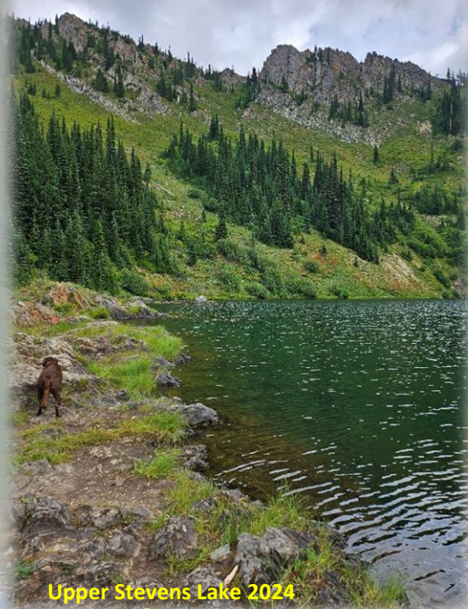
Upper Stevens Lake 2024

then angles up and away from the lower lake. This lower area behind the rock can be under water early in the year, so the trail may not be usable for 20-30 feet. It is only about 200 feet in elevation gain between the lakes and the trail is good.