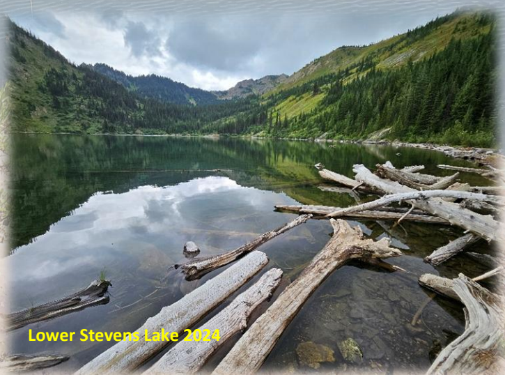
Lower Stevens Lake 2024

only stock a few hundred fish every 6-7 years then it won't take long for it to get fished out.