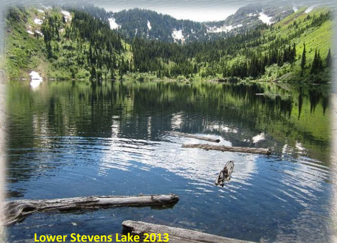
Lower Stevens Lake 2013

At the Lake: There are several well-defined and beaten down campsites by the outlet; a couple to the right and a couple higher on the bench to the left. There is also a campsite on the other side of the lake near the rock outcrops. This is a very well used lake; one time I hiked in on a Friday and saw at least 4 camping parties coming in and I was out before 2 pm.