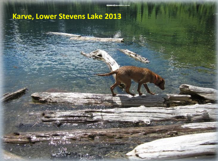
Karve, Lower Stevens Lake 2013

only stock a few hundred fish every 6-7 years then it won't take long for it to get fished out.