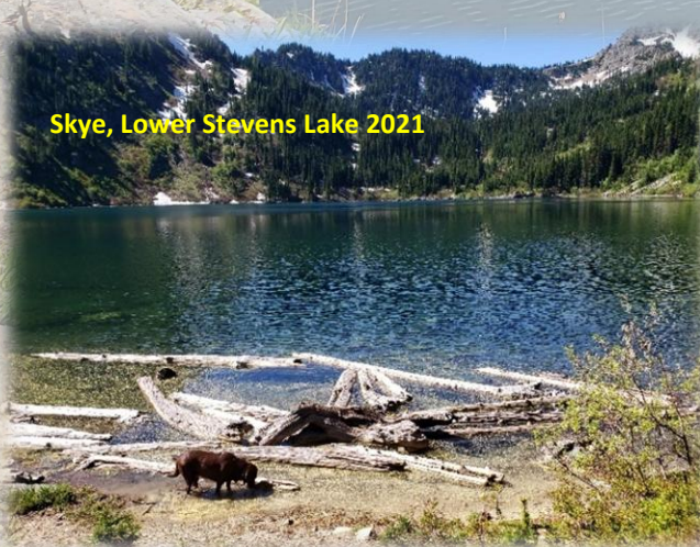
Skye, Lower Stevens Lake 2021