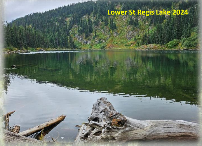
Lower St Regis Lake 2024