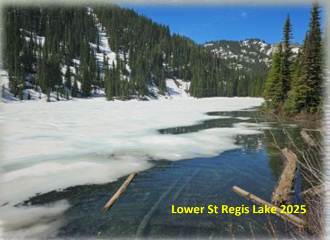
Lower St Regis Lake 2025