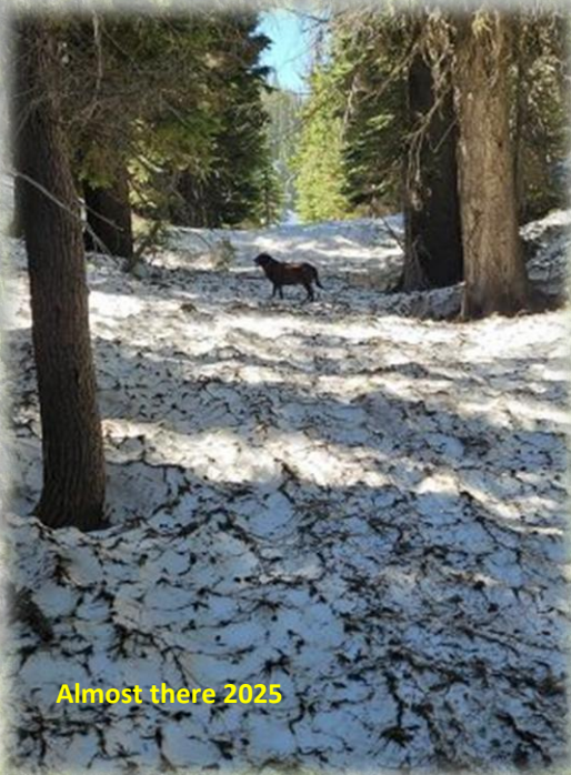
Almost there 2025