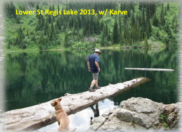
Lower St Regis Lake 2013, w/ Karve

If not, then continue up the access road for 1/4 mile and bear left on the old road to the creek crossing. In 2024, Lookout Pass appears to be installing a gate at this junction to block access to the Eagle Peak expansion. Bear to the right after crossing and continue for another half mile to the trailhead. The trailhead parking is very limited, just a couple vehicles if people park