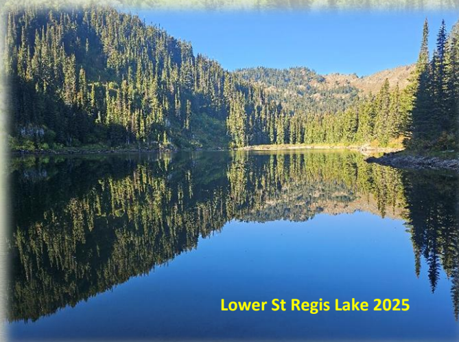
Lower St Regis Lake 2025