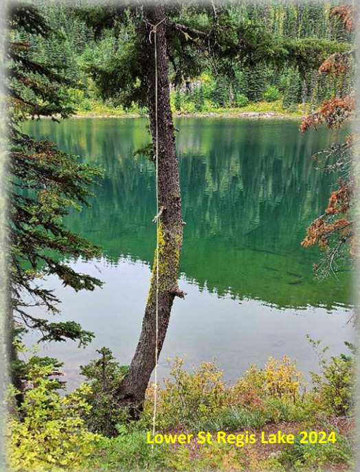
Lower St Regis Lake 2024