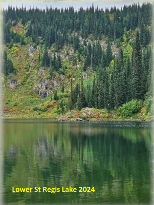
Lower St Regis Lake 2024