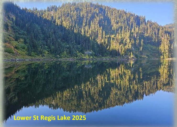
Lower St Regis Lake 2025