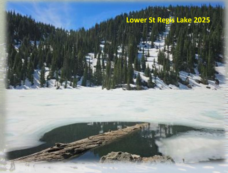
Lower St Regis Lake 2025