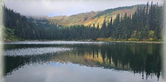
Lower St Regis Lake 2024

with some consideration. There are also places along the way to park and add a bit of distance to your hike. The trail (#267) starts at the parking area, there is also a small place to camp, and goes about a hundred yards where you angle down to the right and cross the creek coming out of the St. Regis basin. This early part of the trail is accessed by SxS and bikes until the creek crossing, then heads up toward the state line. Trail #267 crosses the creek then moderately meanders across the hillside for about a mile and crosses the