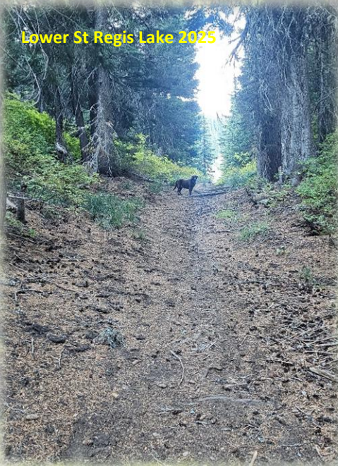
Lower St Regis Lake 2025

with some consideration. There are also places along the way to park and add a bit of distance to your hike. The trail (#267) starts at the parking area, there is also a small place to camp, and goes about a hundred yards where you angle down to the right and cross the creek coming out of the St. Regis basin. This early part of the trail is accessed by SxS and bikes until the creek crossing, then heads up toward the state line. Trail #267 crosses the creek then moderately meanders across the hillside for about a mile and crosses the