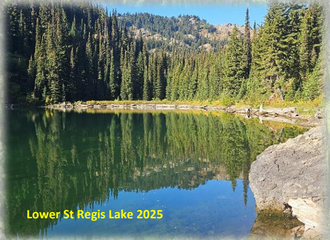
Lower St Regis Lake 2025