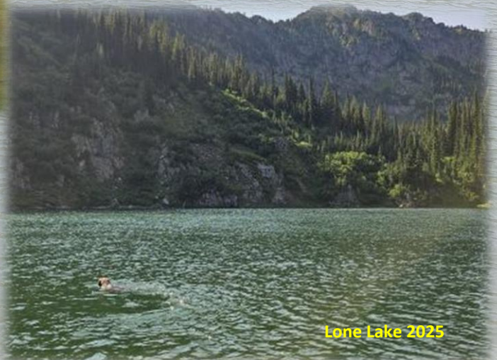
Lone Lake 2025