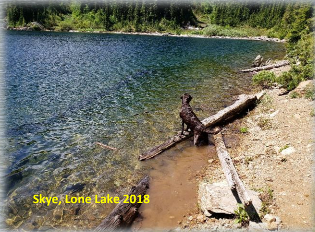
Skye, Lone Lake 2018