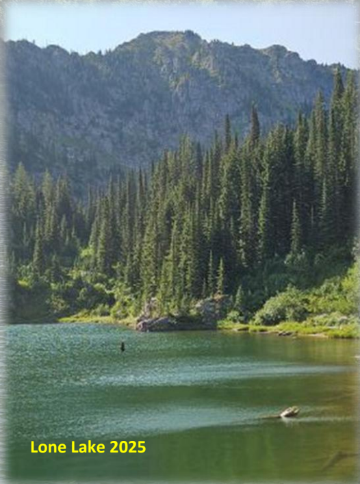
Lone Lake 2025