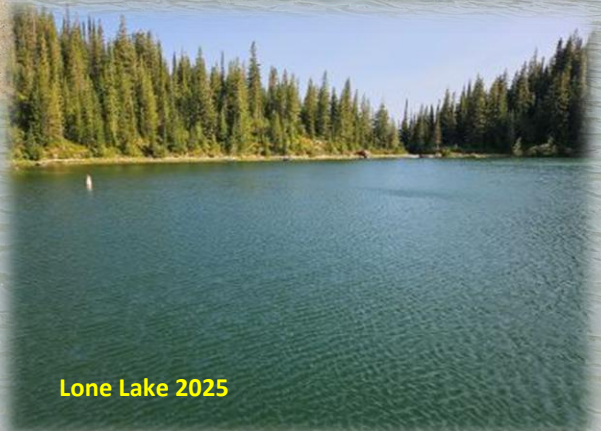
Lone Lake 2025