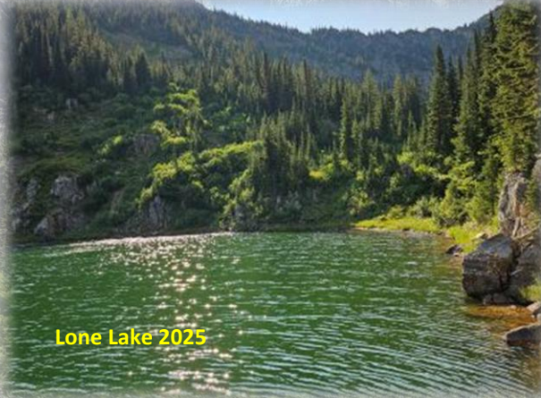
Lone Lake 2025

trailhead. There is some water outside of the waterfall from small seeps but can be limited during the latter part of the summer and early fall.