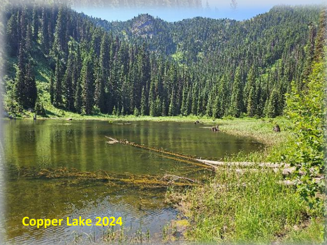
Copper Lake 2024

that could bust a tire. The trail (#265) is an old mining road that is drivable with a SxS, motorcycle or E-bike. The road climbs steadily past an old mine tailings pile and eventually to the lake at about the 1.25-mile marker.