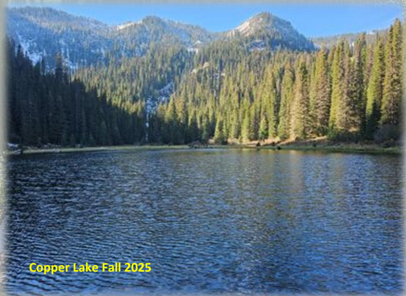
Copper Lake Fall 2025