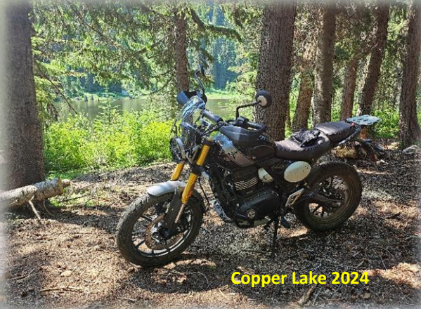
Copper Lake 2024

road that is a bit beat up as people can drive in. There is an additional small site on the other side of the outlet.