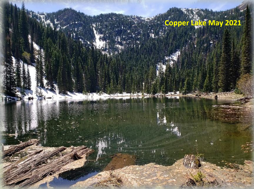
Copper Lake May 2021