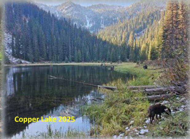
Copper Lake 2025