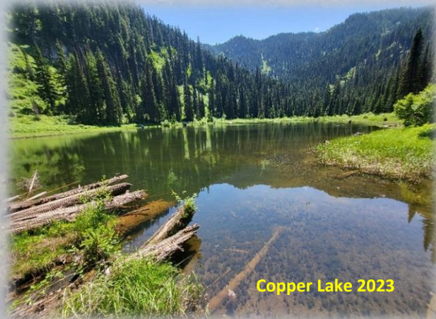
Copper Lake 2023