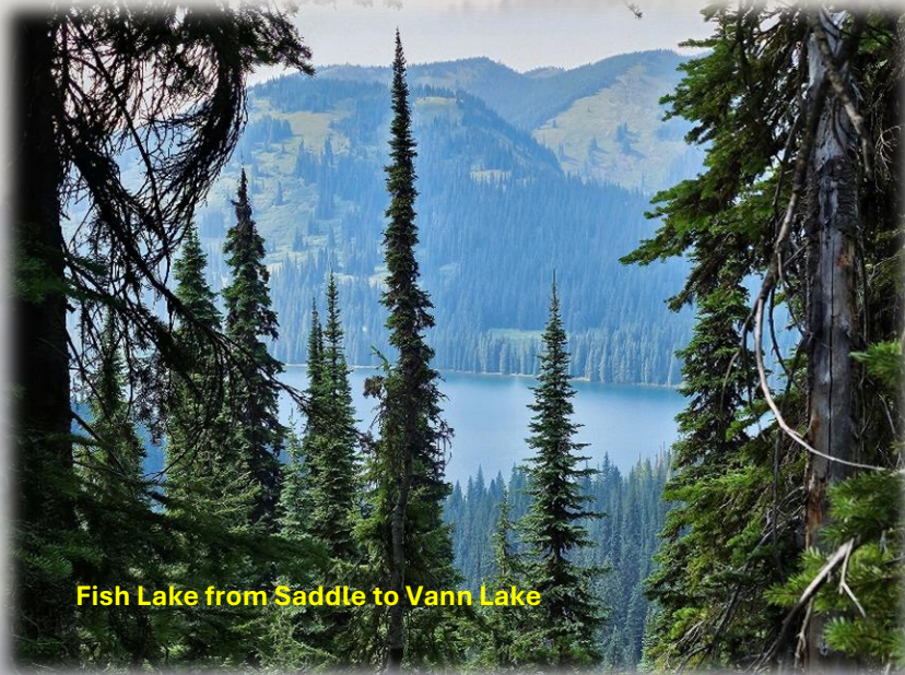
Fish Lake from Saddle to Vann Lake