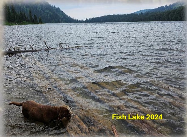
Fish Lake 2024

Getting There: Take the Fish Creek Exit on I-90 and proceed up Fish Creek Road #343, then the right fork on road #7750 (Iowa State Research Center) that ends at the Clearwater Crossing in 6.75 miles. The clearwater crossing has a small campground (3 sites), 2 vault toilets and a Forest Service Guard Station. Cross the West Fork of Fish Creek on the stock bridge to pick up trail #101. Follow trail #101 for 9.25 miles to Foley Basin where trail #114 to the Lower Siamese intersects.