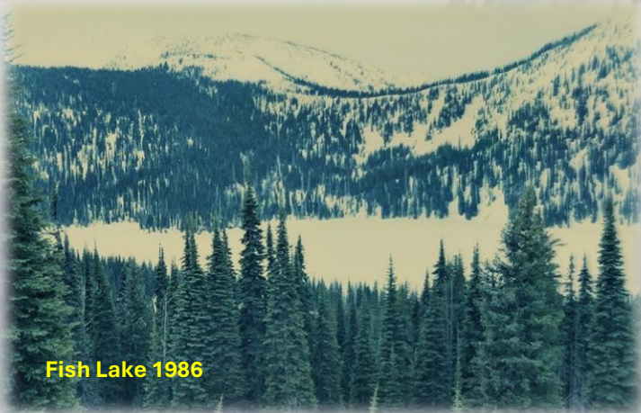
Fish Lake 1986

okay it is a road. Stay on this well-defined route for 6 miles to Fish Lake, the largest lake in the Great Burn area. Trail #419 moderately climbs up the valley crossing two creeks (Siam & Japanese) and several other small creeks with just the middle couple miles a bit steeper, so it is easy to make good time. Once you cross the 350+ foot boardwalk you are about 1/2 mile from the lake.