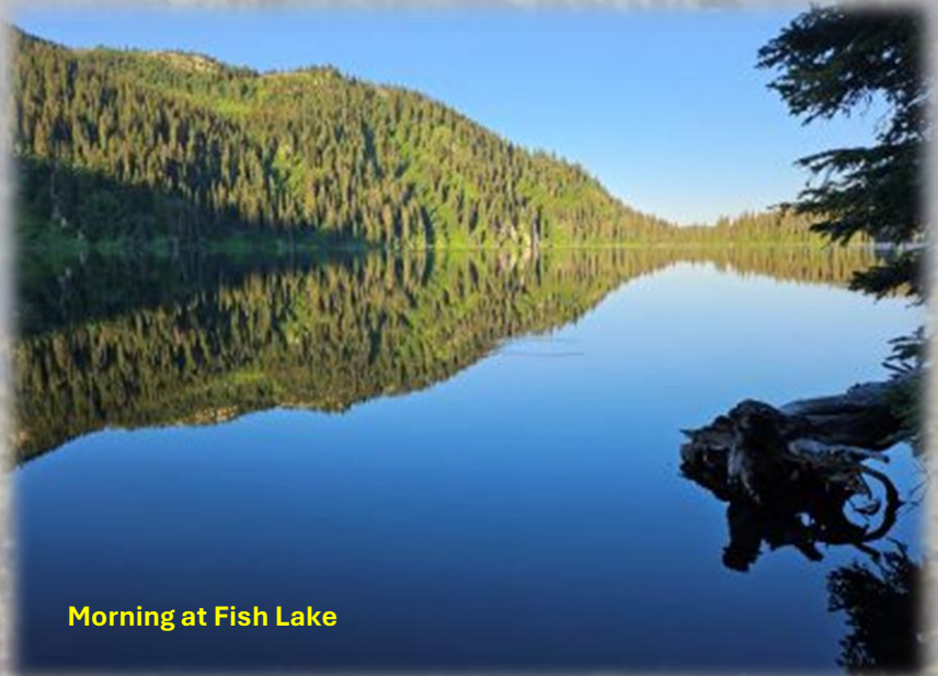
Morning at Fish Lake