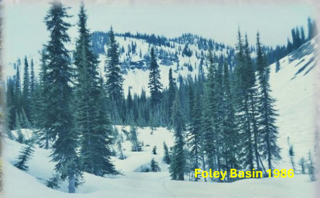
Foley Basin 1986