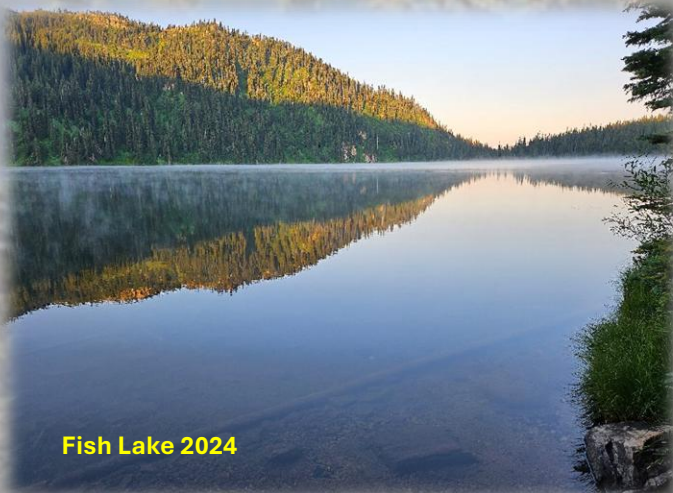
Fish Lake 2024

crosses Long Creek and stays left of the Clearwater River. If you cross the river and get to the Cedars Campground, you have gone too far. Stay on road #250 for another half (.5) mile then stay left on road #295 up Lake Creek for about 4.5 miles. There will be a picnic area / trailhead with a vault toilet at the intersection.