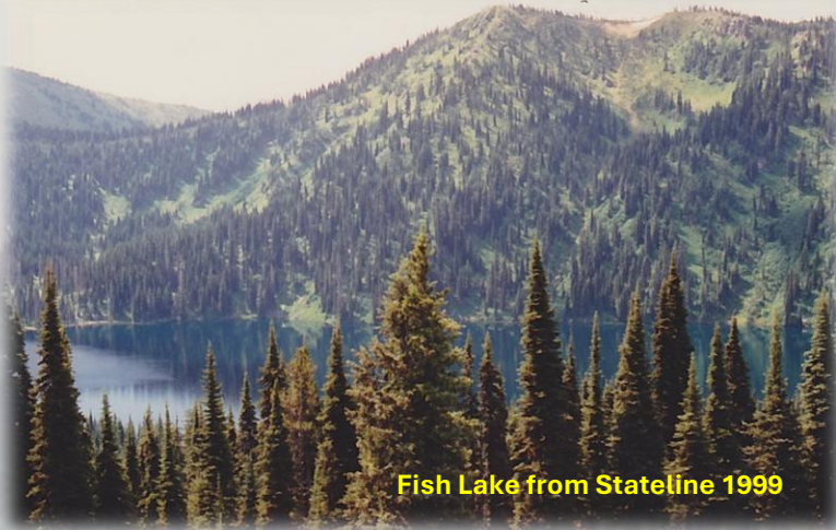
Fish Lake from Stateline 1999

At five miles the trail (#121) out of Indian Creek crosses the West Fork and connects with trail #101. The trail continues up the valley to Foley Basin at a moderate grade with a steeper grade around the couple switchbacks after passing by the creek coming out of the Siamese Lakes. At Foley Basin the left fork (#101) climbs moderately up to the state line and Fish Lake in about a mile. The right fork is